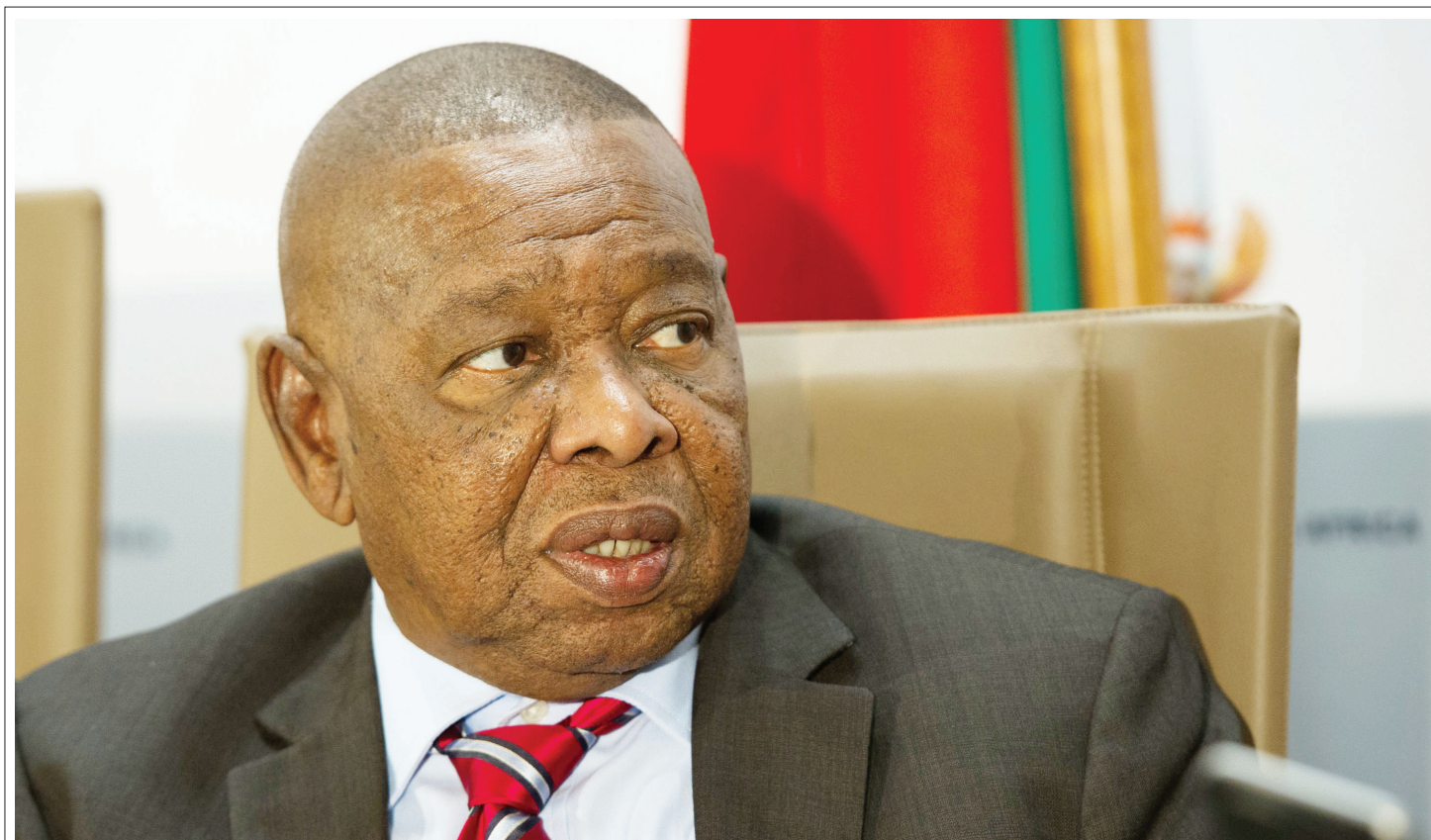
Higher Education and Training Minister Blade Nzimande says government wants to strengthen post-school learning and teaching.