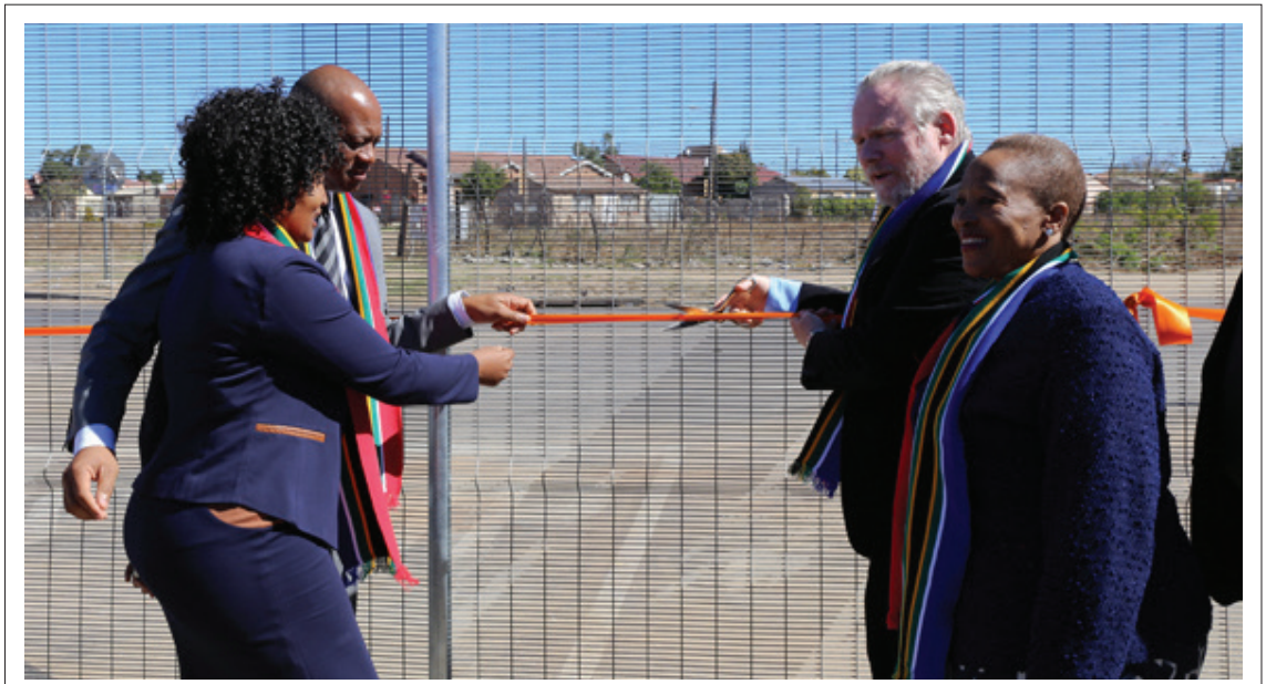
The Department of Trade and Industry spent R21 million for the first phase of the Seshego Industrial Parks.