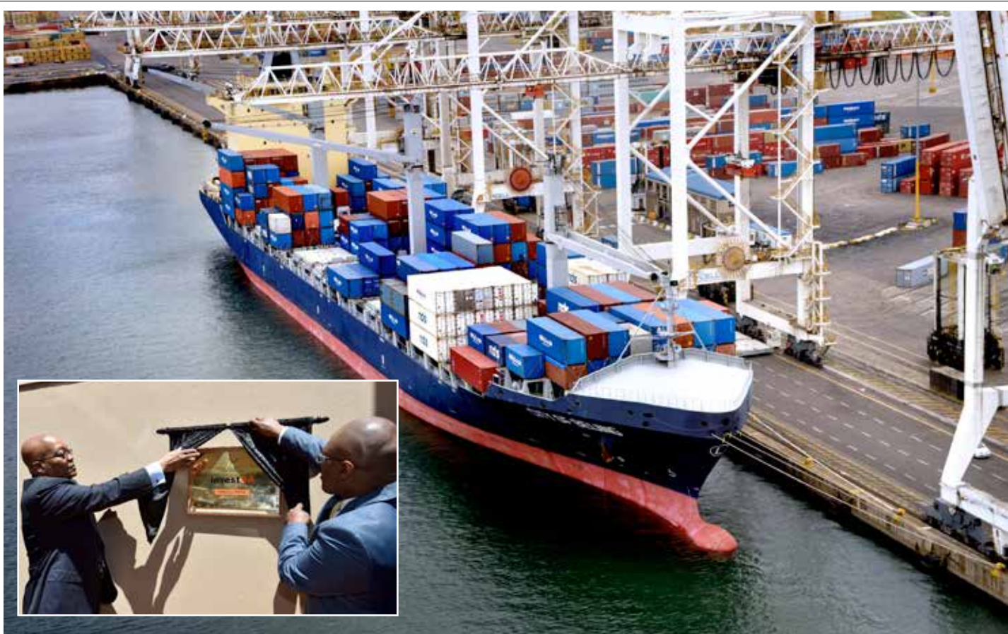
■ The KwaZulu-Natal InvestSA One Stop Shop is expected to create much-needed jobs in the province.

ANOTHER INVESTSA One Stop Shop has been launched to provide investors with services to fast-track projects and reduce red tape.