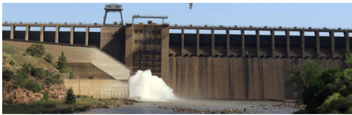
■ Ngokusebenzisa iikomiti zeewadi uluntu lunganegalelo kwizigqibo ezithathwa ngamabhunga oomasipala.