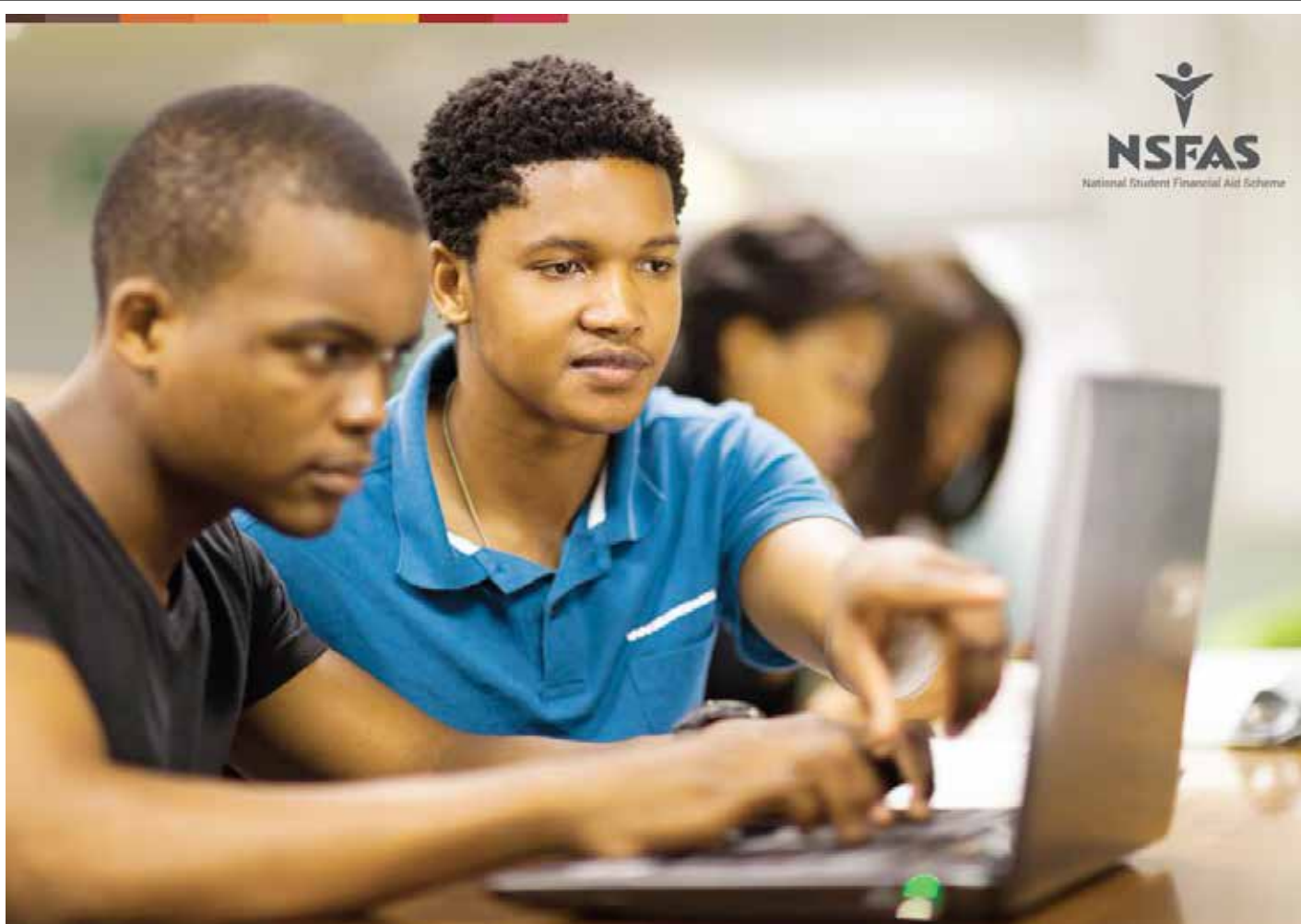
■ NSFAS will communicate with qualifying students, once 2018 academic results have been made available.

THE NATIONAL STUDENT Financial Aid Scheme (NSFAS) received over 400 000 applications for 2019.