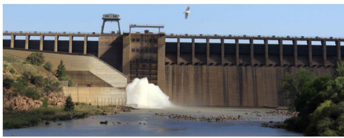
Emalunga emphakatsi angabeka luvo lwawo ngetincumo letitsatfwa imikhandlu yawo kumakomiti emawadi.