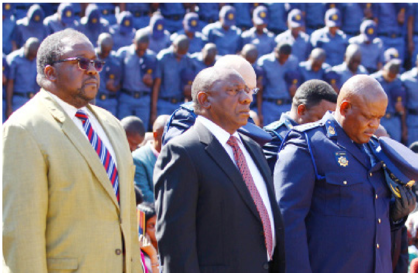
Deputy President Cyril Ramaphosa (centre), Minister Nkosinathi Nhleko, and Acting National Commissioner Kgomotso Phahlane during the South African Police Services' Annual Commemoration Day.