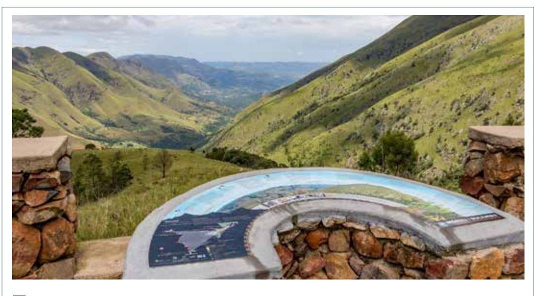
The Barberton-Makhonjwa Mountains declared a World Heritage Site.