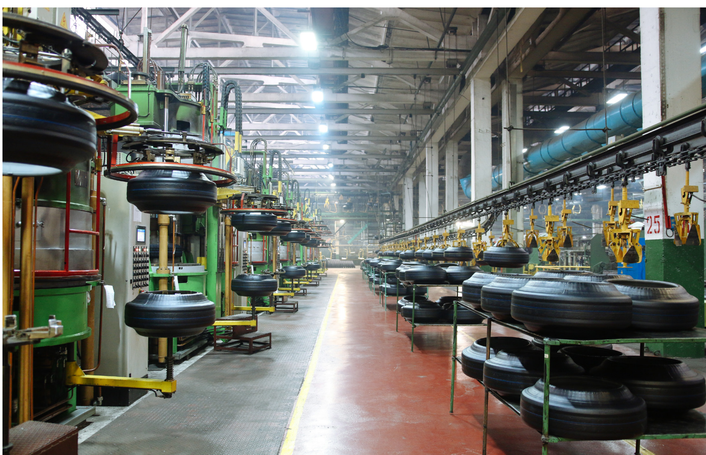
■ Sumitomo Rubber South Africa has invested about R970 million in the South African economy.

KWAZULU-NATAL to benefit from foreign investment by a Japanese tyre company.