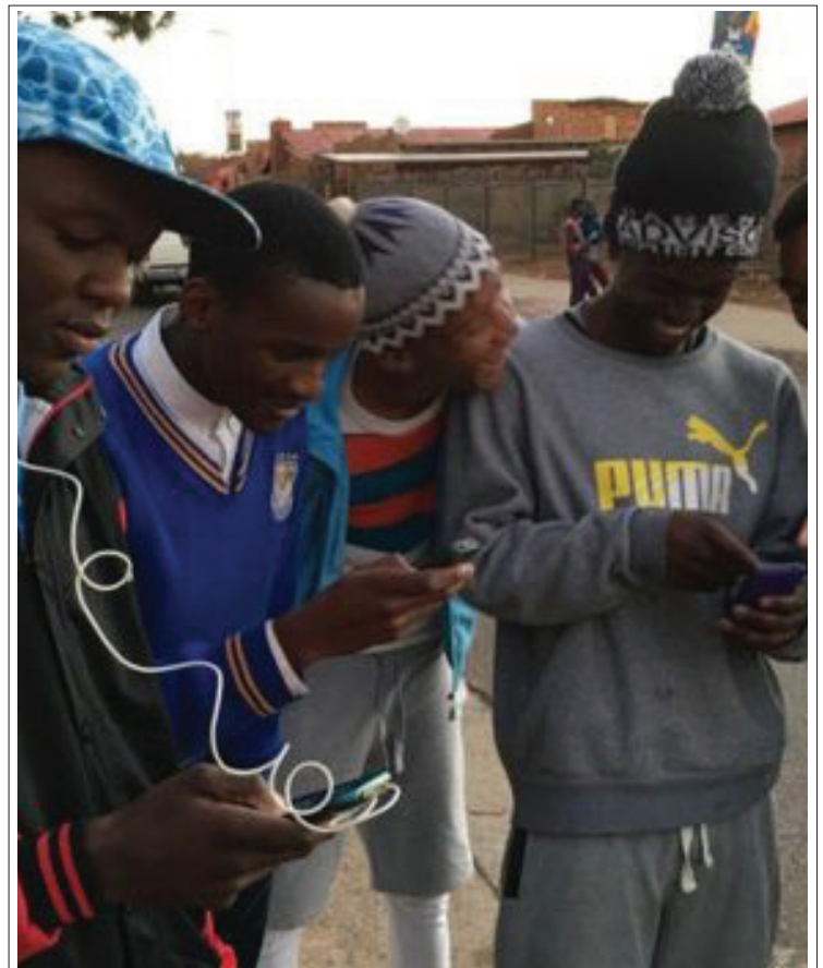
University students will benefit from the free WiFi service launched by eThekweni Municipality.

“Digital life has made life easier for everyone but accessing Internet in the townships is a mission. Sometimes I have to come all the way to the library to get connected and do my university work. It would be great to have WiFi hot-spots on every corner of the township so that we can all get unlimited connection and do our work,” he said. ■