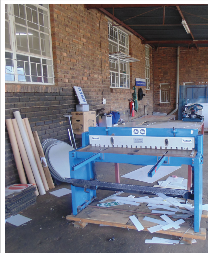
■ Nomcebo Printers e gola ka lebelo la go makatša, ditebogo di lebišwa go thekgo ya Etšentshi ya Tlhabollo ya Dikgwebopotlana.

Seda e thušitše khamphani ye ka go tšweletša peakanyo ya mošito ya taolo ya ditšhe-