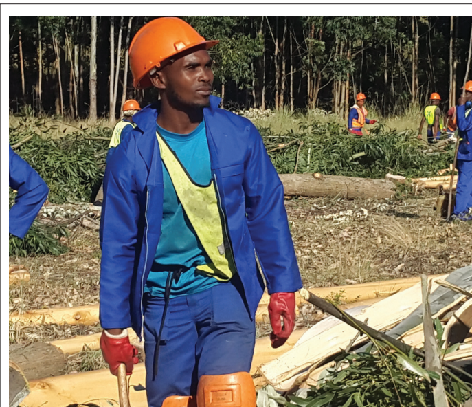
Maloko a setšhaba protšekeng ya dithokgwa ya Mkambati, kgauswi le Flagstaff, ba gare ba theogetše mo protšekeng ye laolwago ke bona.

“Bophelo bo fetogile kudu go tloga mola protšeke ye e thoma. Ba bangwe ba rena re be re sena mešomo. Bjale bophelo bo kaonafetše ka gore re kgona go fepa bana ba rena le go ba iša