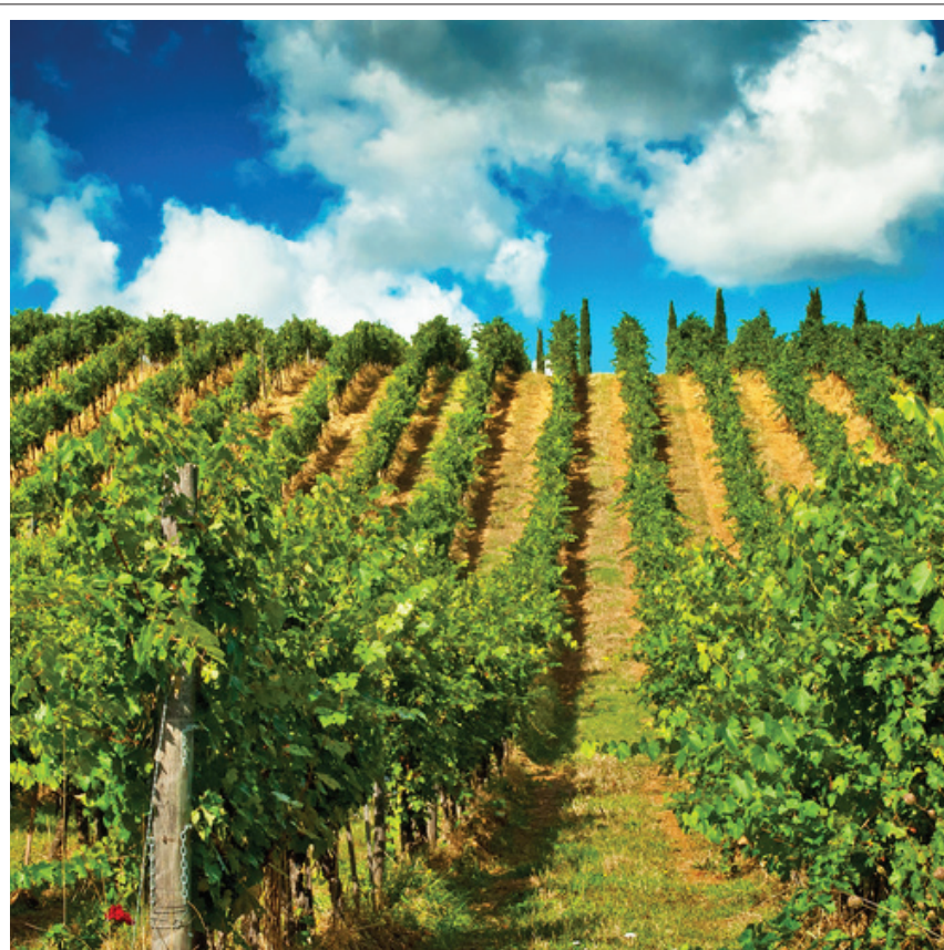
Bašomedi ba bantši ba dipolasa ba tlo holwa ke pholisi ya mmušo ye nyakago go thuša baholegi go ba benthoto ba bobedi fao ba šomago goba ba dulago.

BALEMI BA BEINE GO LA Kapa Bodikela ba ikgafetše go dira se sengwe go matlafatša bašomedi ba bona le go tliša dipolelo tše kaone.