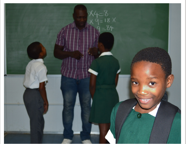
Lenaneo la REAP le hlomamisitswe ho ntlafatsa boleng ba ho ithuta le ho ruta tsamaisong ya thuto ya mahaeng Afrika Borwa.

"Bohloko ba baithuti ba rona ba tswa malapeng a senang batswadi ha ba bang ba hlokomelwa ke bonkgono le bontatemoholo. Ha hona batho ba ka ba thusang ka mesebetsi wa sekolo kapa ho ba kgothalletsa ho bala, mme sena se ama tshebetso ya bona sekolong," o hlalositse jwalo.