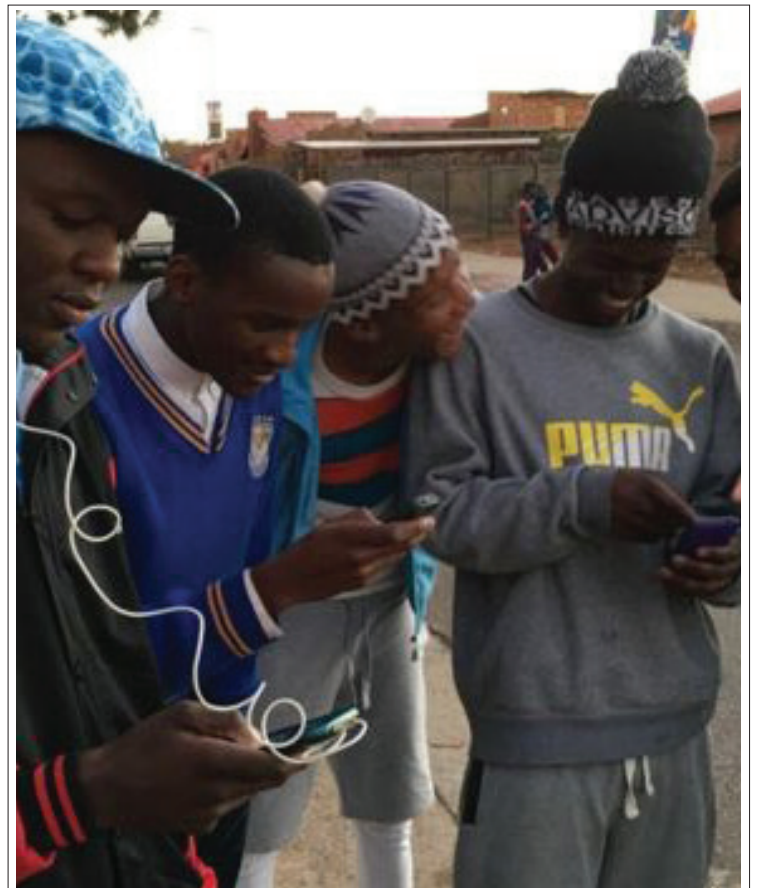
University students will benefit from the free WiFi service launched by eThekweni Municipality.

“Digital life has made life easier for everyone but accessing Internet in the townships is a mission. Sometimes I have to come all the way to the library to get connected and do my university work. It would be great to have WiFi hot-spots on every corner of the township so that we can all get unlimited connection and do our work,” he said. V