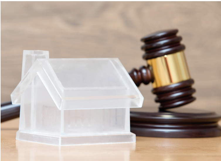
Make sure you understand your rights when you are dealing with the sheriff of the court.