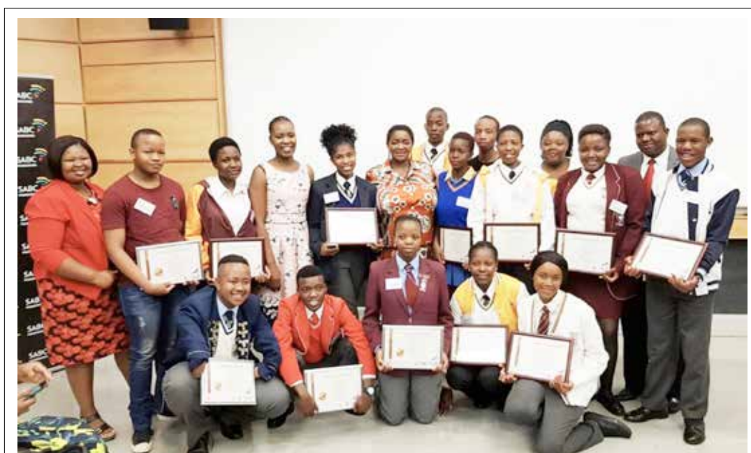
Some of the the country's top matric achievers who are also social grant beneficiaries with Minister Bathabile Dlamini (centre).