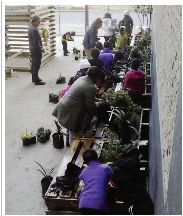
■ Ho tlisa ho nahana ka talafatso dikolong.

samente e ommeng le diphaletse tsa patsi di ile tsa hlabollwa botjha bakeng sa ho aha diphaposi tsa borutelo le ho betla fenetjhara, fuluru ya laeborari e ile ya alwa ho sebediswa