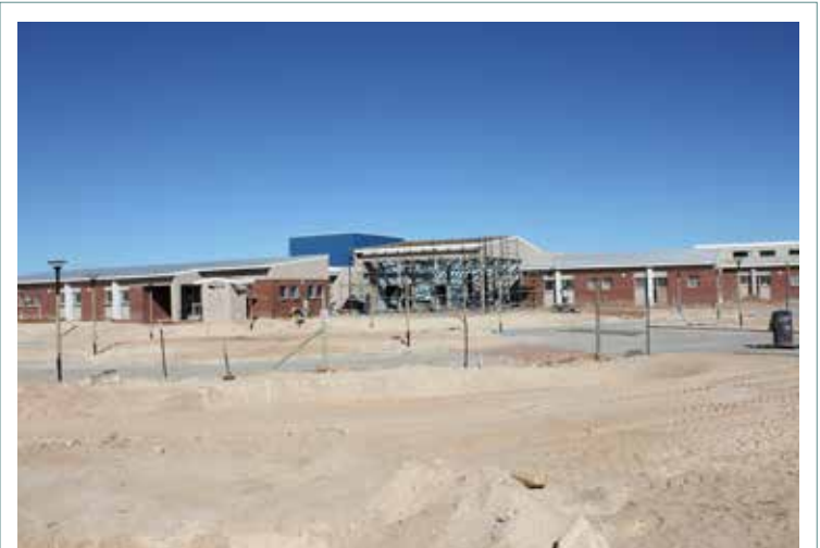
■ Construction on a new community health centre in Port Nolloth in the Northern Cape is almost complete. The facility will soon offer the small town greater access to healthcare services.

The project has created decent job opportunities. A majority of these jobs were reserved for the local community and a lot of the work on site, such as glass fittings and