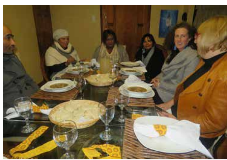
■ Baeti ba natefelwa ke dijo tsa mantsibuya tse tsamaiswang ke Sehlopha sa Explore our Hood ho la Thembaletu jwalo ka karolo ya letsholo la Dine with Locals .

Ba ile ba rutwa ka ho iqalla le ho itsamaisetsa dikgwebo tsa bona, ka maikemisetso a hore ebe batho ba ikgollang