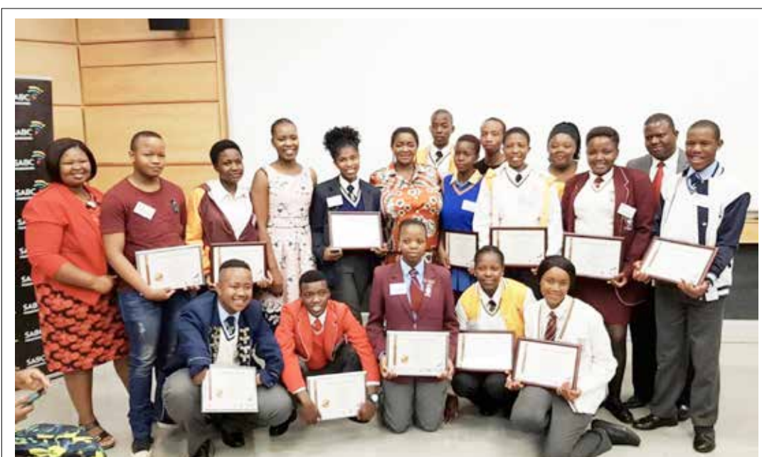
Some of the the country's top matric achievers who are also social grant beneficiaries with Minister Bathabile Dlamini (centre).