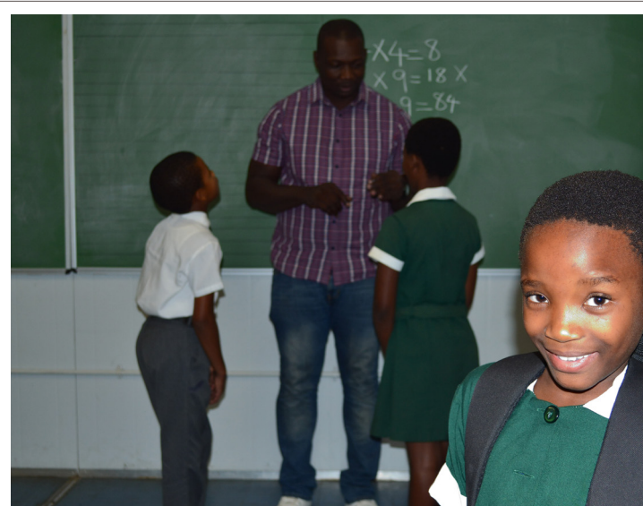
Lomklamo Wabasiti Ngemfundvo Yasemakhaya (i-REAP) usulungelwe kwenta kancono emazinga ekufundza nekufundzisa kuluhlelo lwetemfundvo yasemakhaya eNingizimu Afrika.

“Bafundzi betfu labanyenti bavela emakhaya lange-nabatali kantsi labanye banakekelwa bogogo. Abanabo bantfu labangabasita ngemisebenti yesikolo yasekhaya noma babakhutsate kutsi bafundze, kantsi loku kwelhlisa lizinga labenta ngalo eklasini,” asho achaza.