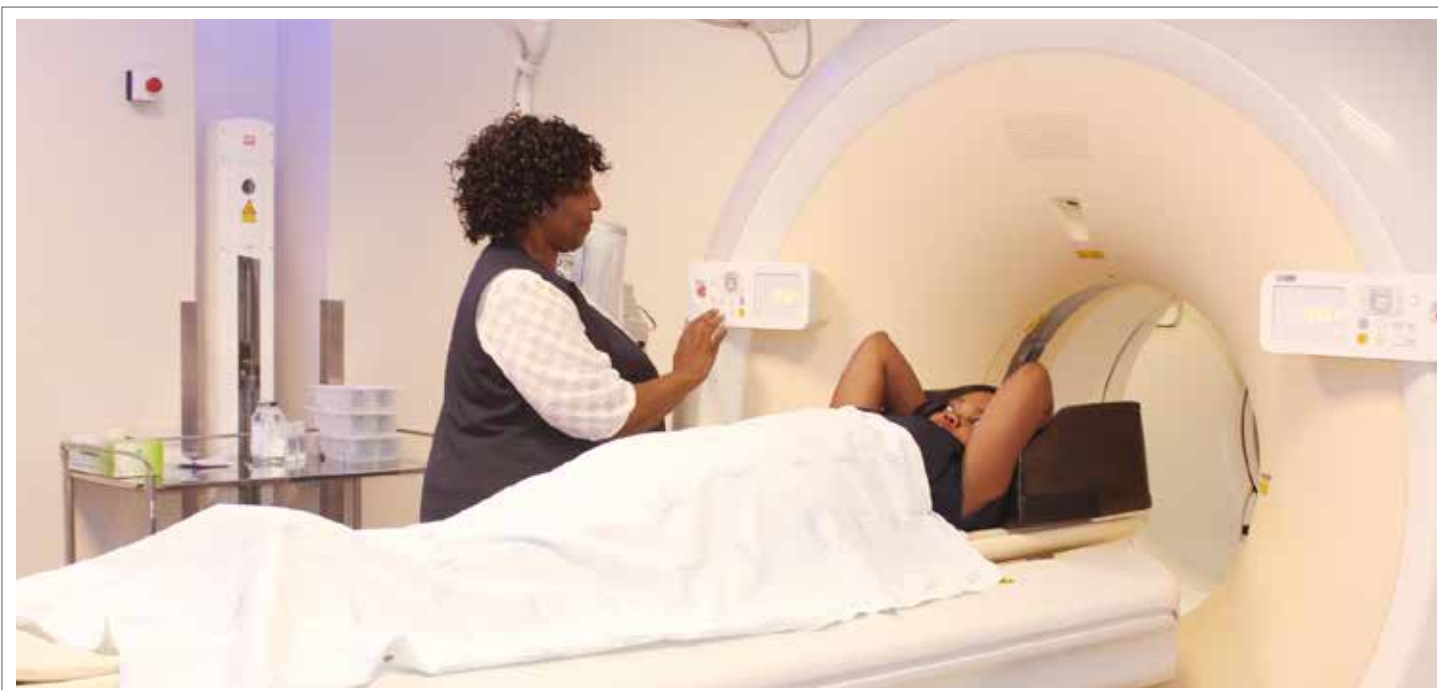
Residents of Ga-Rankuwa and surrounding areas now have access to state-of-the-art oncology unit.

GOVERNMENT INVESTS in the latest technology to assist cancer patients.