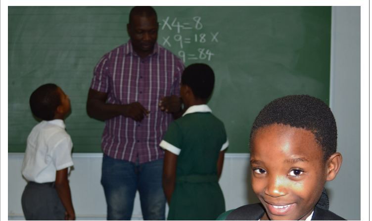
Thandela ya Thusedzo ya Pfunzo ya Mahayani (REAP) yo rwelwa țari u itela u khwinisa khwalithi ya u guda na u funza kha sisiteme ya pfunzo ya mahayani Afrika Tshipembe.

Vho řalutshedza uri: "Vhunzhi ha vhagudiswa vhashu vha bva kha mahaya o rangiwaho phanđa nga vhana ngenho vhañwe vha fhasi ha