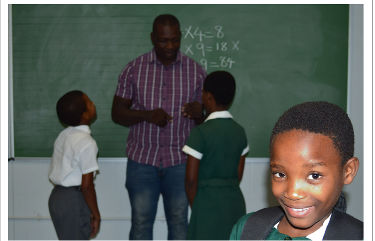
Phurojeke ya Mpfuno wa Dyondzo ya le Matikoxikaya (REAP) se yi simekiwile ku antswisa nkoka wa ku dyondza na madyondzisele eka sisiteme ya dyondzo ya le matikoxikaya eAfrika-Dzonga.

Xikolo xa yena xi na kwalomu ka vadyondzi va 387 kusuka eka Gireyidi R kufika eka 7 lava va tsariseke lembe leli. "Vadyondzi va hina vo tala va huma eka mindyanguni leyi yi rhangeriwaka hi vana kasi van'wana va le hanshi ka vuhlayisi bya vakokwa wa vona. A va na vanhu lava nga va pfunaka hi mitirhokaya kumbe ku va