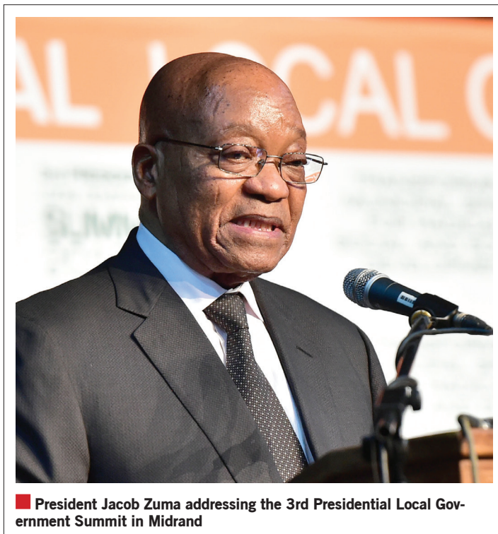
President Jacob Zuma addressing the 3rd Presidential Local Government Summit in Midrand

"They must revitalise and mainstream township economies by supporting the development of township enterprises, cooperatives