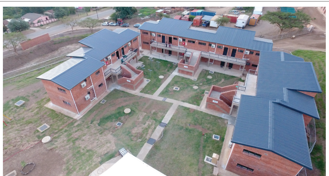
■ Phurojeke ya tindlu ya le Westgate yi languteriwile ku nyika kwalomu ka 1 000 wa tiyuniti ta tindlu, yi ta tshamisa kwalomu ka 4 000 wa vavuyeriwa loko yi fikelele emakumu.

"Tindlu leti i ta n'wina. Ndza mi kombela leswaku mi nga xavisi tindlu ta n'wina. Hi lemukile mahanyelo yo ka ya nga amukeleki laha vavuyeriwa va tindlu ta mfumo va xavisaka tindlu ta vona ivi va tlhela va hlupheka nakambe. Mi fanele ku swi tiva leswaku mi ni nkarhi wun'we ntsena ku fikelela ku kuma yindlu. Loko mi xavisa yindlu ya n'wina, a mi nga wu kuma nkateko wun'wana wo endla xikombelo xa yindlu nakambe," a vula. ■