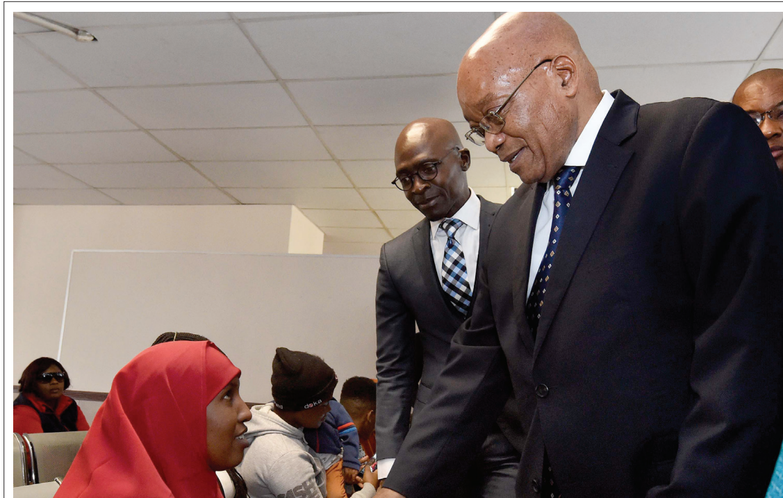
Phuresidente Jacob Zuma a ri na khale ka Holobye wa Timhaka ta Matiko Xikaya Malusi Gigaba va xeweta vahlapfa hi nkarhi wa riendo ro antswisa ndhawu.