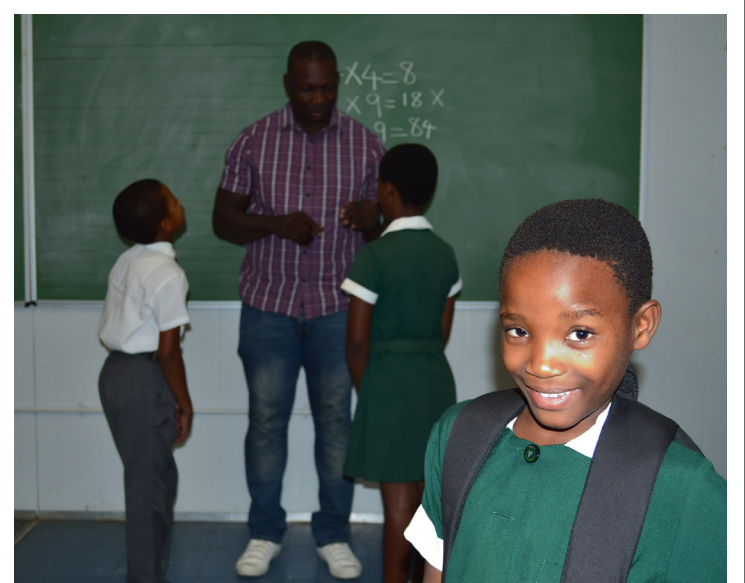
Ihloso yokusungulwa kwe-REAP kukwenza ngcono ikhwalithi yokufunda nokufundisa eenkolweni eziseendaweni zemakhaya welizwe lekhetu.

Wahlathulula ngokuthi, "Inengi labafundi bethu bavela emakhaya atjhejwa bentwana kanti abanye batlhogonyelwa bogogwabo nabobamkhulwabo. Batlhogabantu ababasiza ngomsebenzi wesikolo wekhaya nanyana ababakhuthaza ngokufunda begodu lokhu kuba nomthelela omum-