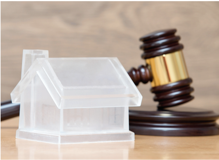
■ Make sure you understand your rights when you are dealing with the sheriff of the court.