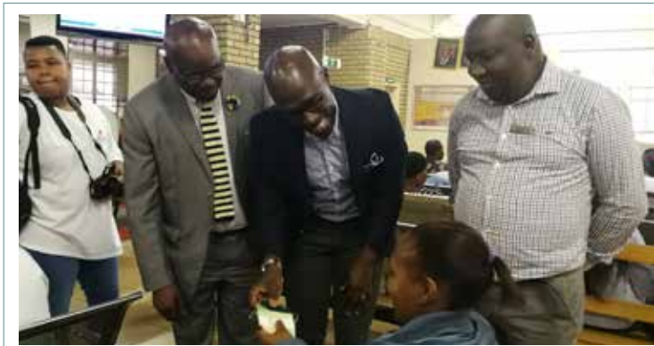
UMphathiswa weMicimbi yezeKhaya uMalusi Gigaba uthi isebe lakhe liza kuqalisa ngezicwangciso zokuphelisa ingxaki yemigca emide.

sezicwangciso zenkqubo isebe lenze ingxelo yokuhlola ukufumanisa indlela efanelekileyo yokulawula kakuhle imigca kunye nokuphucula iinkonzo zayo.