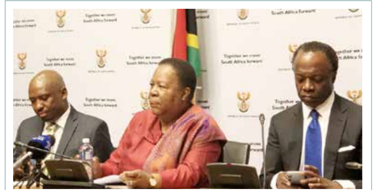
U Sekela-Mphathiswa weMfundo ePhakamileyo noQeqesho uButi Manamela noMphathiswa uNaledi Pandor kunye noSihlalo we-NSFAS, uSizwe Nxasana.

"Oku kuthetha ukuba kufuneka ziphucuke iinkqubo ze-NSFAS kunye nendlela asebenza ngayo. Ngoko ke siye sabekela bucala enye imali ezizigidi