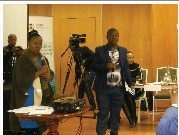
■ Abanikazi bama-SMME abasebancane bakhangisa amabhizinisi abo kubatshalizimali, ngokubaxoxela ngothando lwabo lwezamabhizinisi.