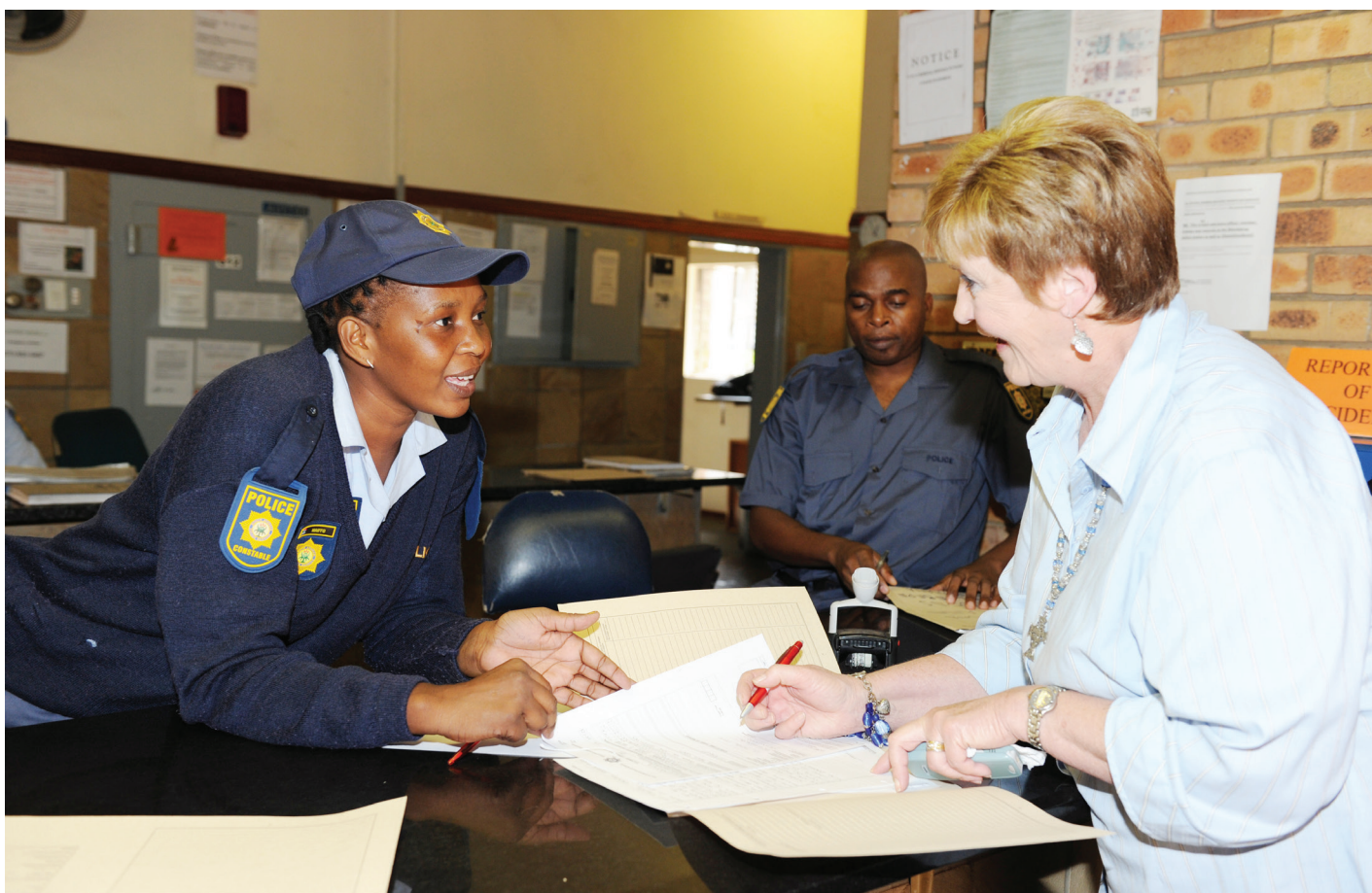
■ South Africans can work together with government to help rid the country of the scourge of corruption.