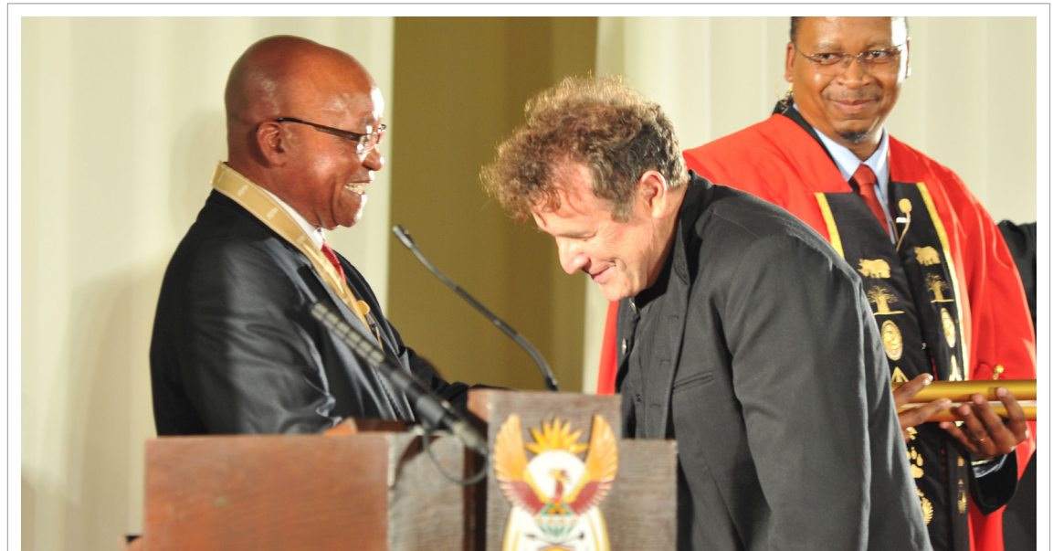
■ Johnny Clegg received the National Order of Ikhamanga – awarded in Silver.

The President has offered his condolences to Mr Clegg’s family, friends and followers, and the broad range of artists and organisations with whom he collaborated in South Africa and internation-