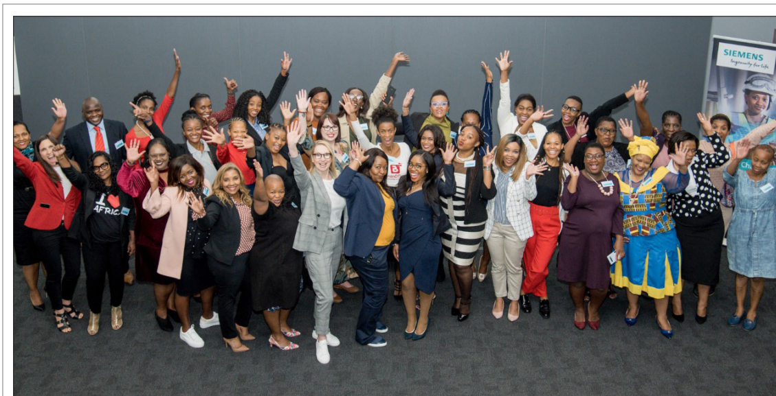
■ Lionesses of Africa has a number of programmes, including business development, mentoring, digital media training, community platforms and networking events.