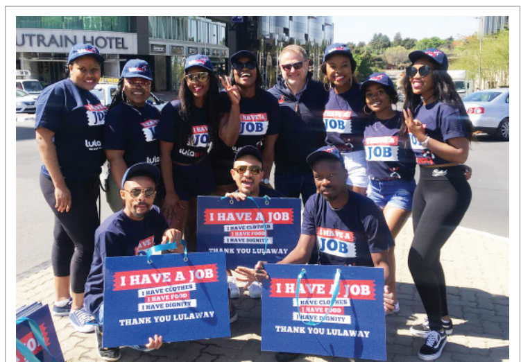
I-Lulaway icashe ebantfu labasha labangetulu kwa-30 000 kulo lonkhe laseNingizimu Afrika noma baniketwa amatfuba ekuceshelwa umsebenti (i-internship).

“Ngalesikhatsi ngiya kuyoceshelwa loluhlelo lwekulungela umsebenti, naloku nje kwakhombisa kufezeka kwemaphupho ami ngoba labantfu lebebasifundzisa bebakwenta ngelutsandvo. Ngavele ngati kutsi kutangisita kutfola umsebenti kantsi akukandluli sikhatsi lesidze, ngacashwa. Ngihlangana nebantfu labanyenti onkhe malanga; bantfu banebumatima bekutfola umsebenti kodvwa ngitibophelele kusita. Ngenca yaloku lengafundziswa kona bantfu bakaLulaway, ngenta umsebenti wami ngeIutsandvo kantsi ngiyakutsandza lelengikwentako,”