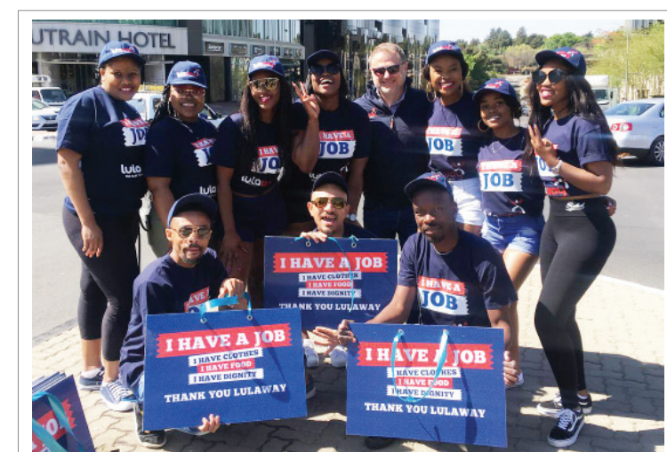
I-Lulaway seyifake intsha eyevile ezi-30 000 eNingizimu Afrika yonkana emisebenzini noma emathubeni okuqeqeshelwa umsebenzi emsebenzini.

“Ngesikhathi ngiyoqeqeshelwa ukulungela ukusebenza, nalokho kwakuwukufezeka kwephupho kimina ngoba abantu ababesifundisa babewenza ngothando umsebenzi wabo. Ngangazi ukuthi kwakuzongisiza ukuthi ngithole umsebenzi futhi akuthathanga isikhathi eside emva kwalokho, ngaqashwa. Ngihlangana nabantu abehlukene nsukuzonke; abantu bakuthola kunzima ukuthola umsebenzi kodwa ngizimisele ukubasiza. Ngenxa yalokho engakufundiswa e-Lulaway, ngenza umsebenzi wami ngentshisekelo futhi ngiyayithanda into engi-