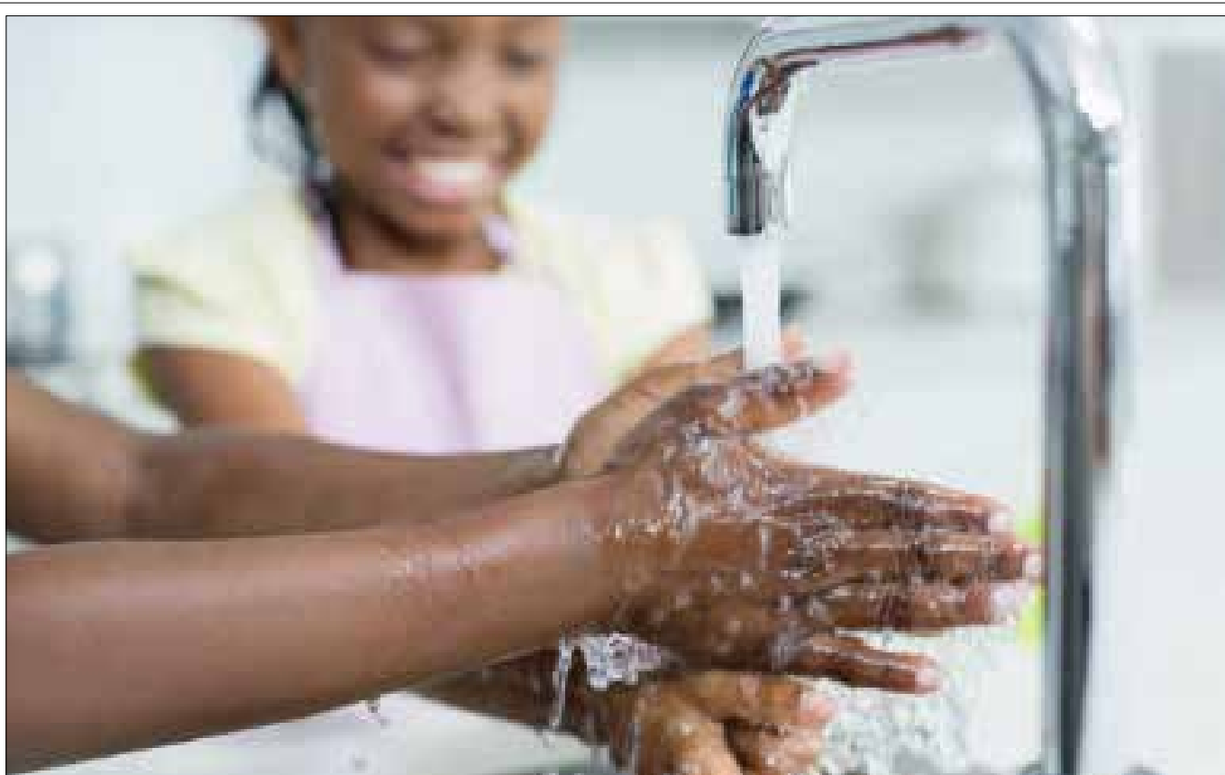
President Cyril Ramaphosa is taking important steps to ensure that the communities of the Waterberg District Municipality receive water and infrastructure projects which are in line with the District Development Model.

P resident Cyril Ramaphosa has announced R25 billion for infrastructure projects in the Waterberg District Municipality in Limpopo.