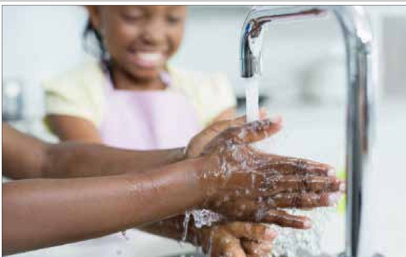
President Cyril Ramaphosa is taking important steps to ensure that the communities of the Waterberg District Municipality receive water and infrastructure projects which are in line with the District Development Model.

President Cyril Ramaphosa has announced R25 billion for infrastructure projects in the Waterberg District Municipality in Limpopo.