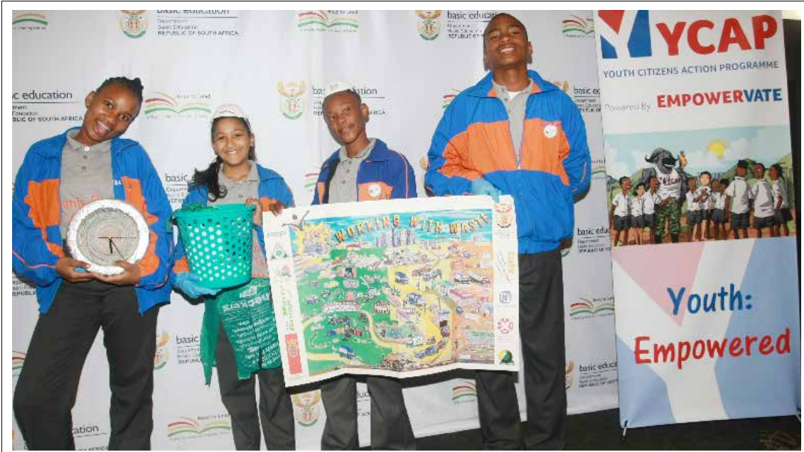
■ Pupils from Oranje Oewer Primary School in the Northern Cape won first prize for coming up with a waste management project to keep their school environment clean.