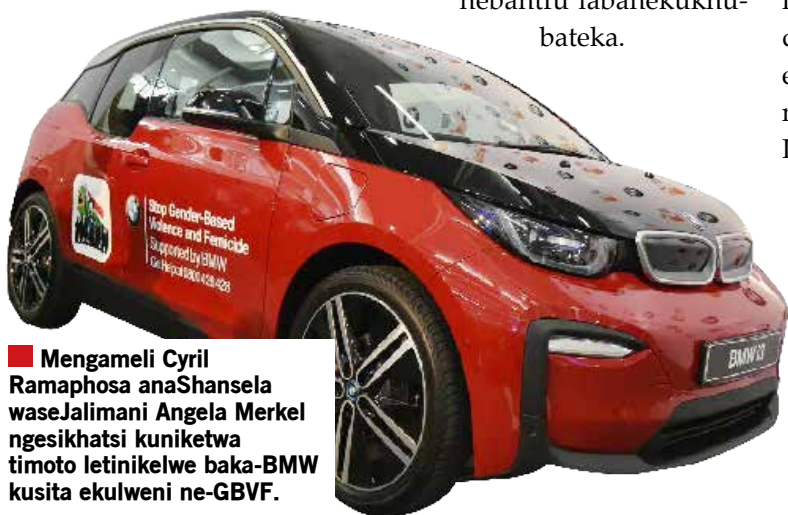
Mengameli Cyril Ramaphosa anaShansela waseJalimane Angela Merkel ngesikhatsi kuniketwa timoto letinikelwe baka-BMW kusita ekulweni ne-GBVF.