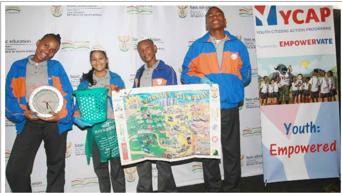
■ Pupils from Oranje Oewer Primary School in the Northern Cape won first prize for coming up with a waste management project to keep their school environment clean.