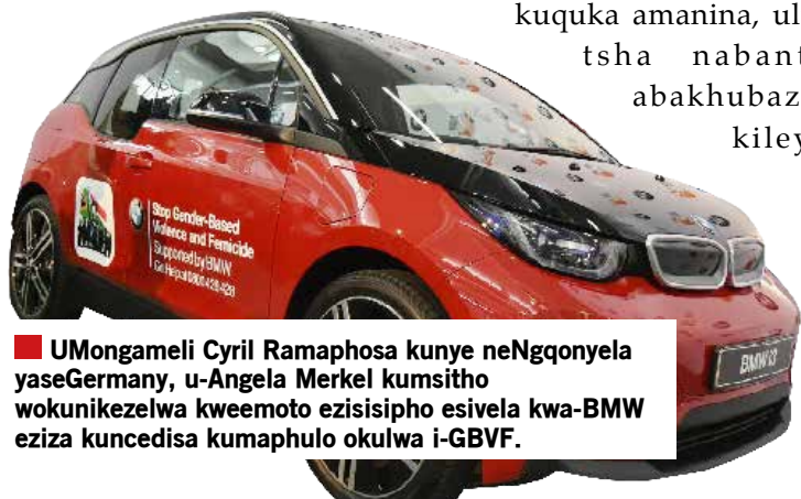
■ UMongameli Cyril Ramaphosa kunye neNgqonyela yaseGermany, u-Angela Merkel kumsitho wokunikezelwa kweemoto ezisisipho esivela kwa-BMW eziza kuncedisa kumaphulo okulwa i-GBVF.