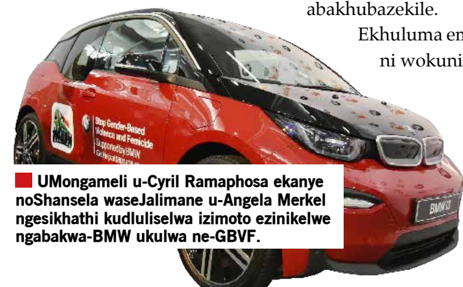
UMongameli u-Cyril Ramaphosa ekanye noShansela waseJalimane u-Angela Merkel ngesikhathi kudluliselwa izimoto ezinikelwe ngabakwa-BMW ukulwa ne-GBVF.

ngezimoto, osanda kwenzeka, nobubanjelwe endaweni yale nkampani yakwa-BMW ekhiqiza izimoto e-Rosslyn, e-Tshwane, uMongameli uthe lezi zimoto zizovikela izimpilo zabantu. Uphinde wadlulisa ukubonga kwakhe okukhulu kule nkampani yakwa-BMW ngokuthi ibe inkampani yokuqala ukunikela ngezimoto, wanxena nezinye ukuthi zilandele ezicathulweni zayo.