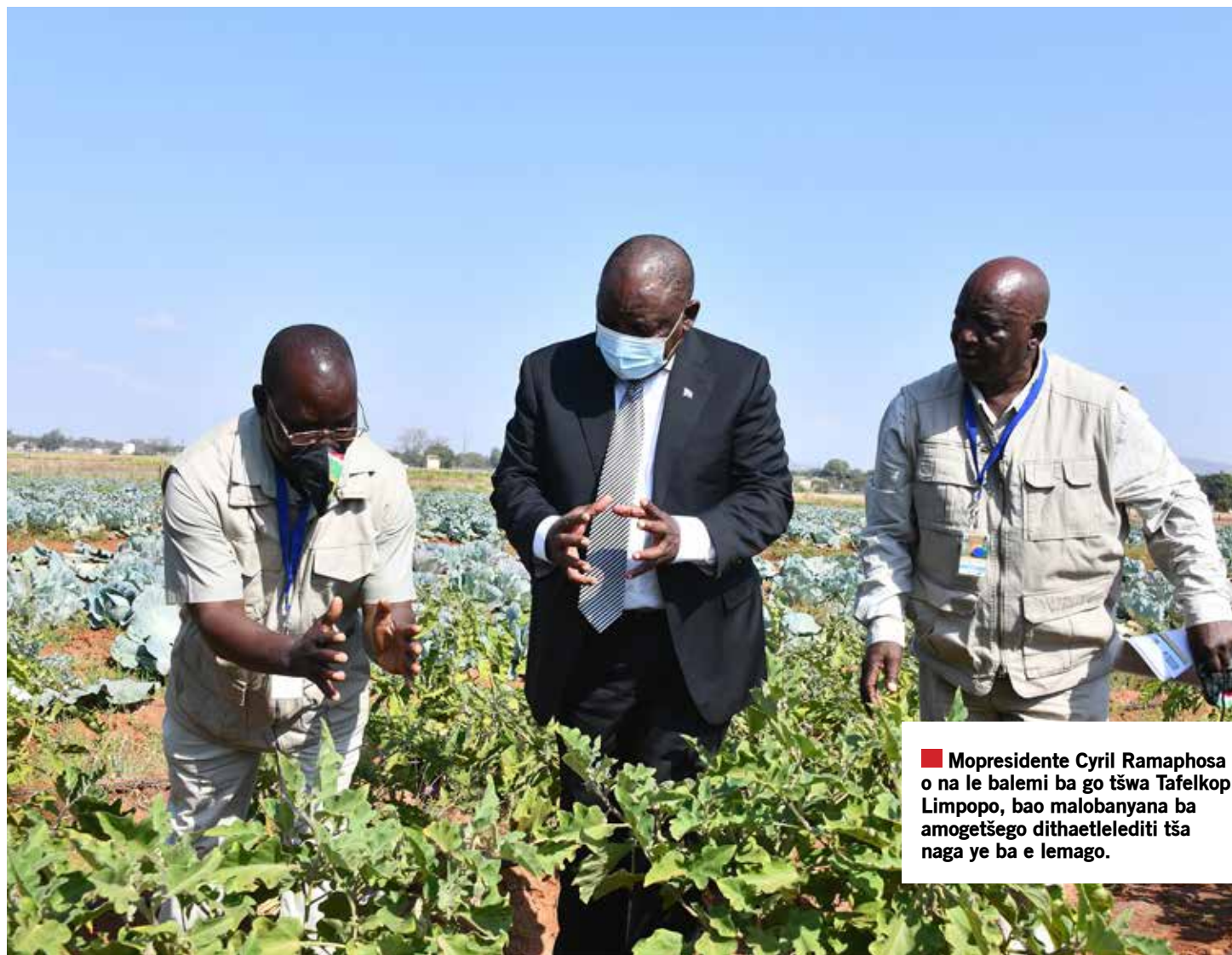
Mopresidente Cyril Ramaphosa o na le balemi ba go tšwa Tafelkop, Limpopo, bao malobanyana ba amogetšego dithaetlelediti tša naga ye ba e lemago.

Malapa a 32 a iphediša ka naga ye le mediro ya temo, e lego seo se hloletšego bašomi ba 128 mešomo ya sammaruri