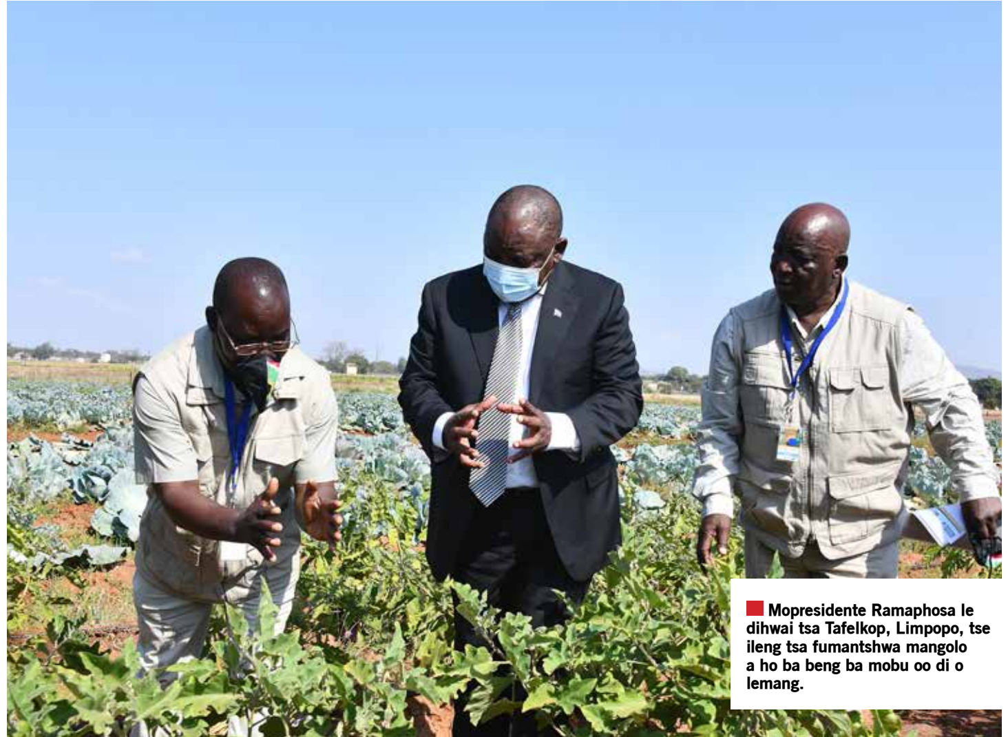
Mopresidente Ramaphosa le dihwai tsa Tafelkop, Limpopo, tse ileng tsa fumantshwa mangolo a ho ba beng ba mobu oo di o lemang.

Ha jwale mobu o sebedisetswa ho lema kwae, le khothone le meroho le ditholwana.