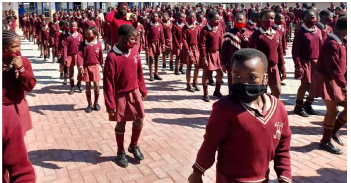
Isikolo esitjha esihle tie iNkululeko Ralo Primary School sinikela ubujamo befundo enesithunzi kubafundi beMbuqe eseMthatha.

Abafundi beNkululeko Ralo Primary School sele banamatlasi wokufundela athe tjha begodu nesentha yeensetj-