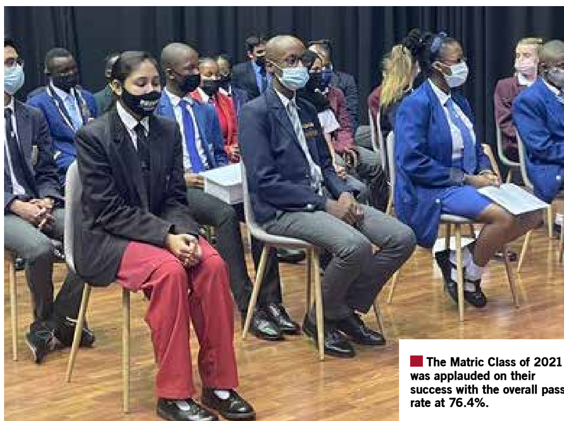
■ The Matric Class of 2021 was applauded on their success with the overall pass rate at 76.4%.

“The number of candidates qualifying for admission to Bachelor studies at universities, is 256 031 – an improvement of 21.4% from 2020. This represents 36.4% of the total number of candidates who wrote the 2021 NSC exams,” the Minister