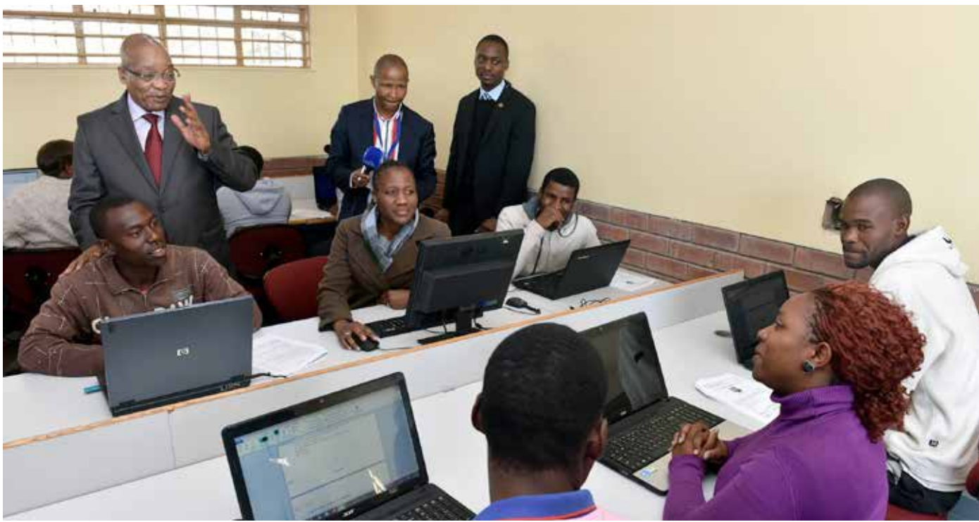
Moporesitente Jacob Zuma o buisana le baithuti go tswa kwa Yunibesithi ya Thekenoloji ya Tshwane.