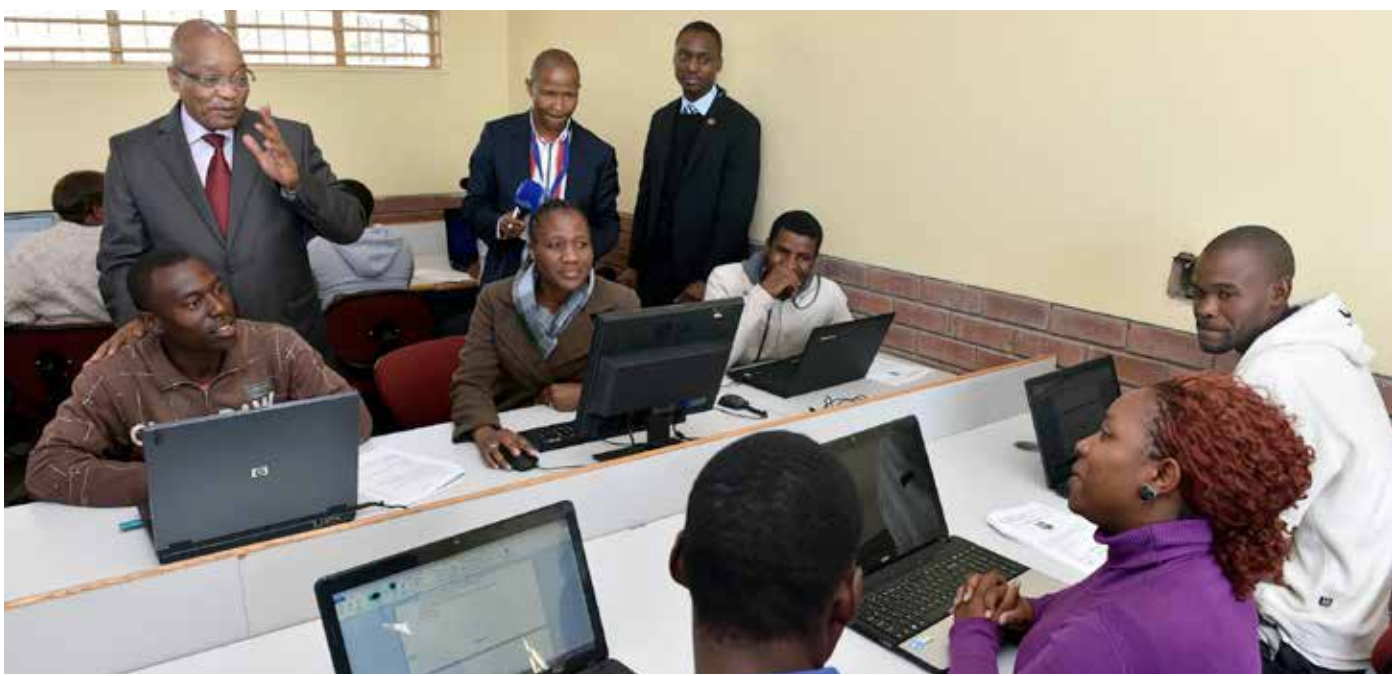
UMongameli Jacob Zuma uthetha nabafundi baseTshwane University of Technology.