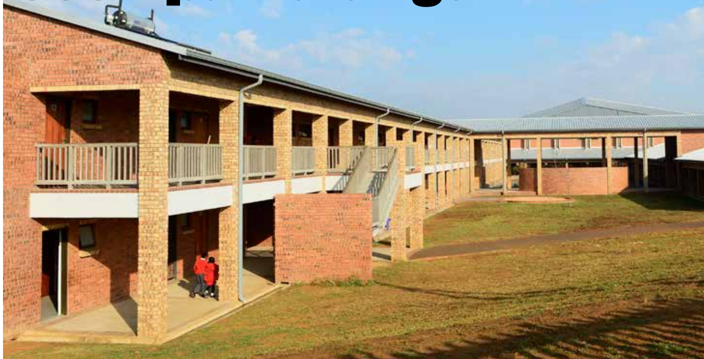
Isikolo sale mihla iMakause Combined School esinokuthatha abafundi abanokufika kwabali-1 200 sisePhola, eMpumalanga.