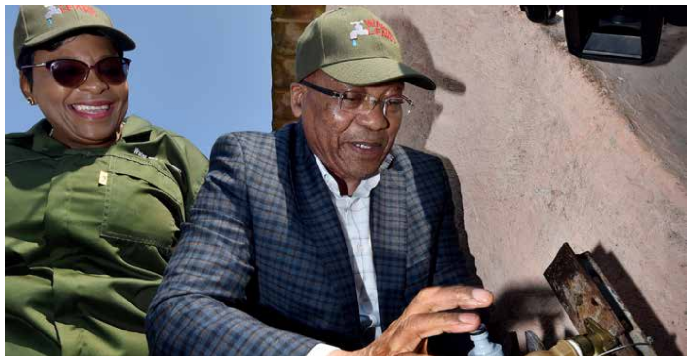
Mengameli Jacob Zuma, ubonakala lapha aneNdvuna Yetemanti Nekuhanjiswa Kwekungcola Nomvula Mokonyane, wetfule luhlelo lwekonga emanti lolutawuphindza futsi ludale ematfuba ekucecshwa kubantfu labasha labatinkhulungwane.

"Enkhulumeni yakhe Yebunjalo Belive, Mengameli uvakalise kukhatsateka mayelana netigidzigidzi letingetulu kwe-R7 letilahleka