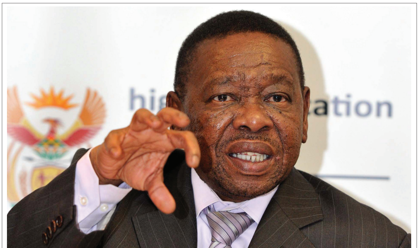
Higher Education Minister Blade Nzimande announced additional funding to help deserving students to complete their studies.

"This funding is made available through the financial aid offices at universities, and students wishing to make use of these bursaries are advised to enroll for critical skills study programmes, which include science, commerce, health sciences, engineering and many others," said Minister