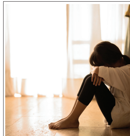
Ku simekiwa ka Tihuvo ta Nawu ta Milandzu ya swa le Masangwini swi vula leswaku vatwisiwakuvava va ta kota ku fikelela vukorhokeri lebyi hetisekeke.

milandzu ya swa le masangwini wu nyika vukorhokeri lebyi landzelaka: