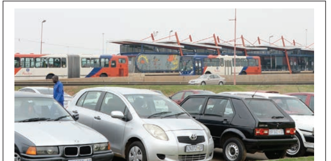
Linyenti lebashayeli betimoto nyalo selipaka timoto talo esiteshini se-ReaVaya bese bagibela emabhasi laya etindzaweni tonkhe eJozi.

Etinyangeni letisitfupha letitako lelidolobhakati litawuchubeka nekukhulisa