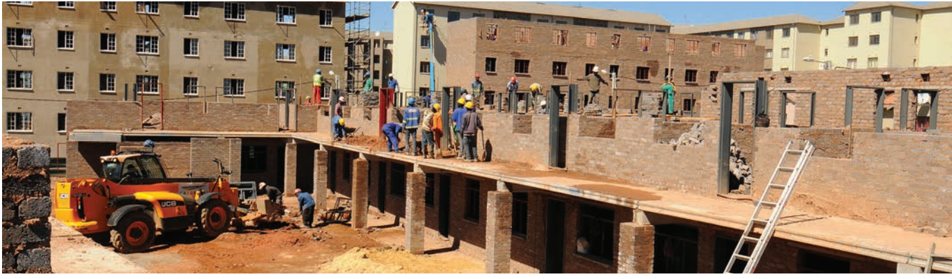
EJozi kunemiklamo lemikhulu leminyenti yetetindlu lesevele ichubeka nome lesahlelwa.

IJozi iyachubeka nekuhamba embili njengelifidolobhakati leleta nemasu lamasha eNingizimu Afrika, ngekubiketela temnotfo letitakwetfula lokuhle ekucaleni kwa-2016. Nanome nje kunetinsayeya tetemnotfo, kwenyuka kwentalo yemali lebolekwako kanye nekwehla nekwenyuka lokusheshako kwetimali letisetjentiswa ngemave, lidolobhakati laseJozi lime labonakala njengalelisibonelo sekusimama kanye nekuphatfwa kahle kwetimali.