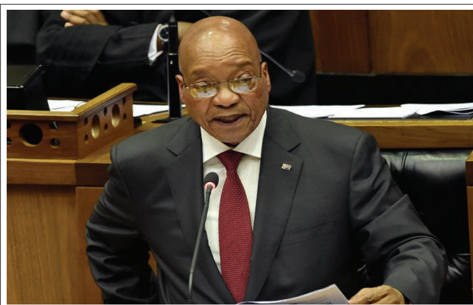
Mengameli Jacob Zuma ugcugcutele bahlali baseNingizimu Afrika kutsi babambisane kute basite ekuchubekiseleni lelive embili.