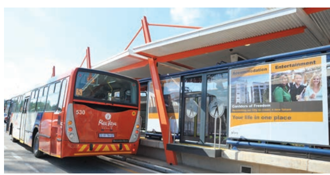
IJozi ilidolobhakati lekucala lelatfuba luhlelo Lwemabhasi Latfutsa Aphindzelela. I-ReaVaya yente ncono indlela bantfu labahamba ngayo.

Takhiwanchanti Tenkhululeko luhlelo lentfutuko lehambisana netekutfutsa lolutakwenta kutsi iJozi igucule luhlelo