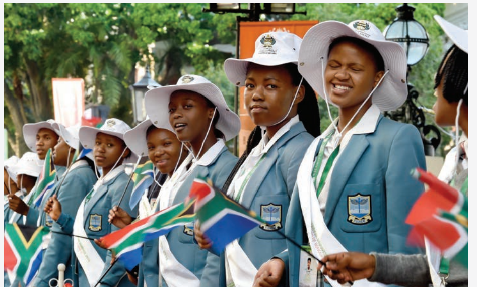
Bantfu labasha baseNingizimu Afrika bebajabulile ngaloko Mengameli Zuma abetakwetfulela sive.

"Sente luhlelo lwavelonkhe lolwemukelwe ngibo bonkhe bahlali baseNingizimu Afrika... Sente temfundvo taba sembili saphindze sehlukenisa litiko kwaba neTemfundvo Lesisekelo kanye neTemfundvo Lephakeme ngenhloso yekwenta kutsi linyenti leahlali baseNingizimu Afrika, lebelikhishelwe ngaphandle ngaphambilini, libe yincenye yetemnotfo," ushito njalo.