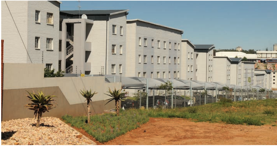
Luhlelo lwekwakhiwa kwetindlu i-Fleurhof lungulolunye lwetinhlelo letinkhulu letihlanganisile tekuhlaliswa kwebantfu eGauteng.

Takhiwo telidolobhakati letingetulu kweli-100 setivele tichunyiwe nge-WiFi kantsi netindzawo leti-370 setivele tinayo. Luhlelo lolungasebentisi tintsambo lwetfuliwe eBraamfonteni, lokwenta kutsi bantfu bakwati kutfoli iWi-Fi lengakhokhelwa kutingcondvomshini letiphatfwako, kumatablets nakubomakhalekhikhini labasebentisa loluhlelo kanye nekutfoli linani lelingu-1GB ngenyanga mahhala.