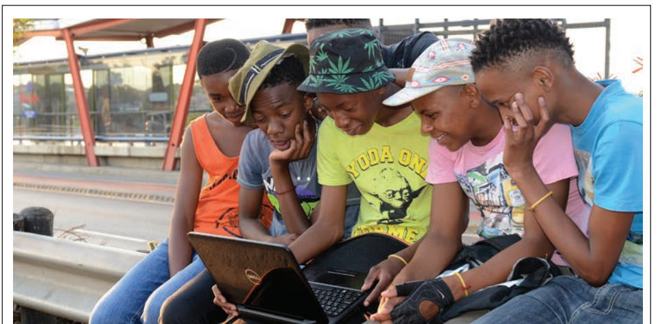
Lidolobhakati iJozi litibophelele ekwakheni imisebenti lemisha leti-200 000 kulusha ngekusebentisa luhlelo lolubitwa i-Vulindlel' eJozi

Kutfolakala kwe-Wi-Fi lemahhala kuya ngekusabalala kulo lonkhe lidolobhakati.