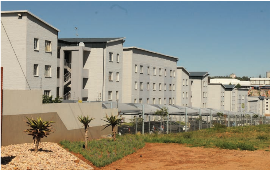
Nhluvukiso wa Fleurhof hi yin'wana ndlela ya nhlanganelo ya matshamelo ya vanhu eGauteng.

Ku va kona ka Wi-Fi ya mahala swa kha swa hangalaka na dorobankulu. Ku tlula 100 wa miako ya dorobankulu yi hlanganisiwile na 370 wa tisayiti ta Wi-Fi ti le ku tirheni. Mexe leyi nga tirhisiki tintambhu yi sungurile eBraamfontein, leyi kotisaka vanhu ku va va koneketa eka Wi-Fi eka tilephtho, thebulete na tiqingho tale nyongeni leti nga na vuswikoti na ku kota ku tirhisa 1GB hi n'hwetini mahala.