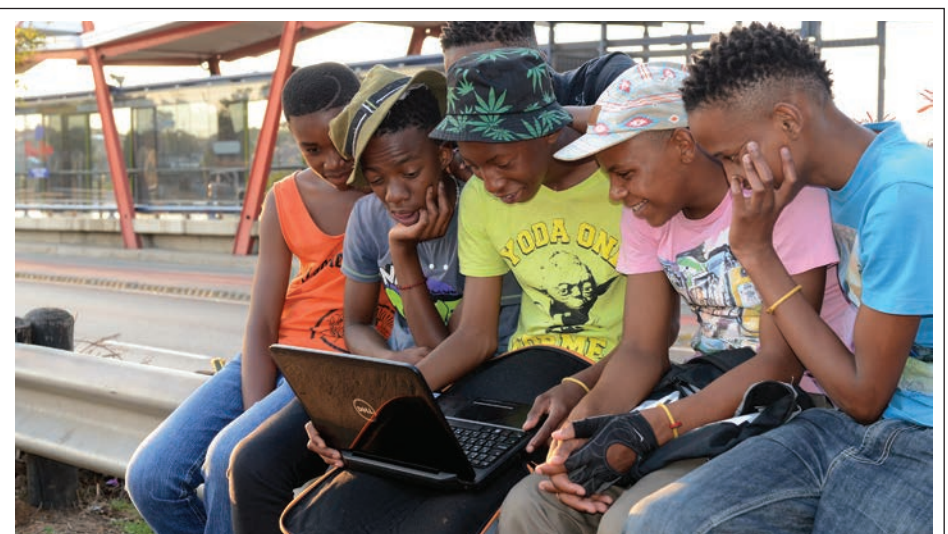
Dorobankulu ra Joni ri tinyiketerile ku tumbuluxa 200 000 wa mitirho yintshwa eka lavantshwa hi pphumba ra Vulindlel' eJozi.

Phurogireme leyikulu ya Smart City yi fikelerile magoza yo hlava swinene naswona yi ta ya emahlweni na ku hangalasiwa eka hafu yo hetelela ya lembe ximali leri.