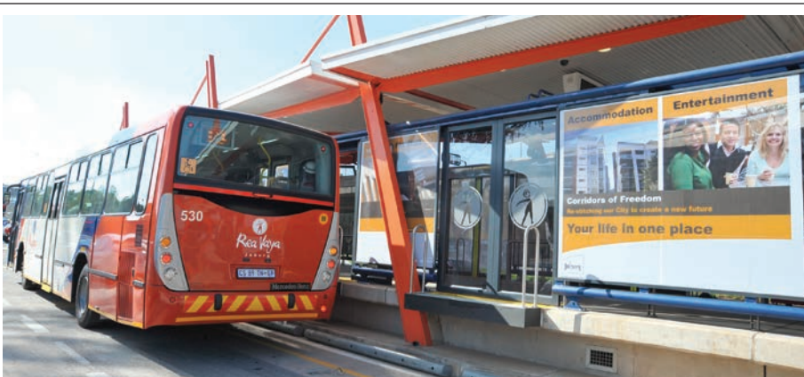
Dorobankulu ra Joni i dorobankulu ro sungula ku simeka Sisiteme ya Mafambelo hi ku Hatlisa ya Mabazi. Sisiteme ya ReaVaya yi antswise ndlela ya mafambelo.