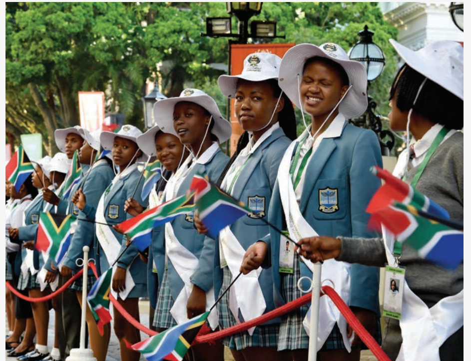
Lavantshwa va Afrika-Dzonga a va tsakile ku lava ku twa leswi Phuresidente Zuma a lava ku byela tiko.

Mfumo, hi Ndzawulo ya Mabindzu na Vumaki, va tumbuluxile mindziriso yo hlayanyana eka malembe lawa ya hundzeke eka ku hlohlotela vuvekisi eka sekithara ya