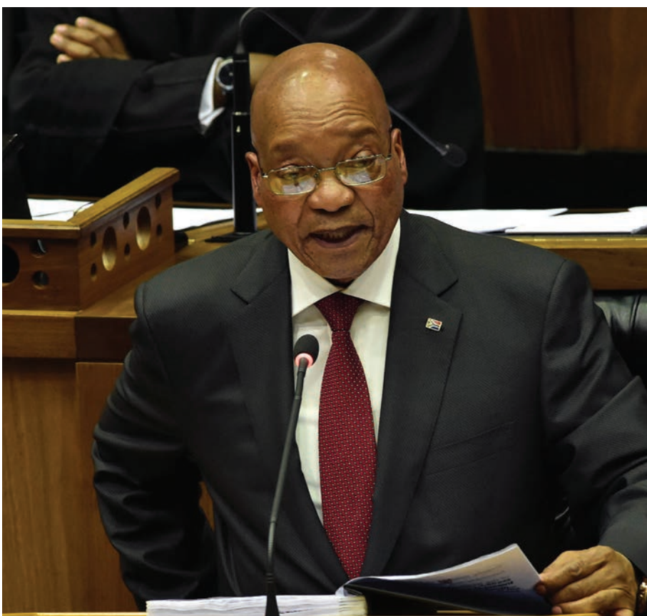
Phuresidente Jacob Zuma u hlohloterile MaAfrika-Dzonga ku tirha swin'we ku pfuna ku yisa tiko emahlweni.