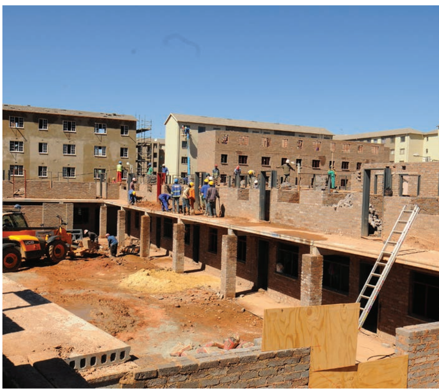
Ku na tiphurojeke letikulu ta tindlu leti nga eku akiweni kumbe leti ta ha kunguhatiwaka eJoni.

Joni ri tshama ri ri karhi ri rhangela tanihi hi dorobankulu leri nga musunguri eAfrika-Dzonga, leri ri kombisaka ku va ri ri na xiyimo xa kahle xa ikhonomi emasungulweni ya 2016. Hambiloko ku ri na mintlholtho ya ikhonomi, ku tlakuka ka mit-swalo na ku tshamelo ku cincacinka ka xiyimo xa timali ta misava, Dorobankulu ra Joni ri kombisa ku va ri ri xikombiso xa tshamiseko wa mafambiselo ya vutlhari bya timali.