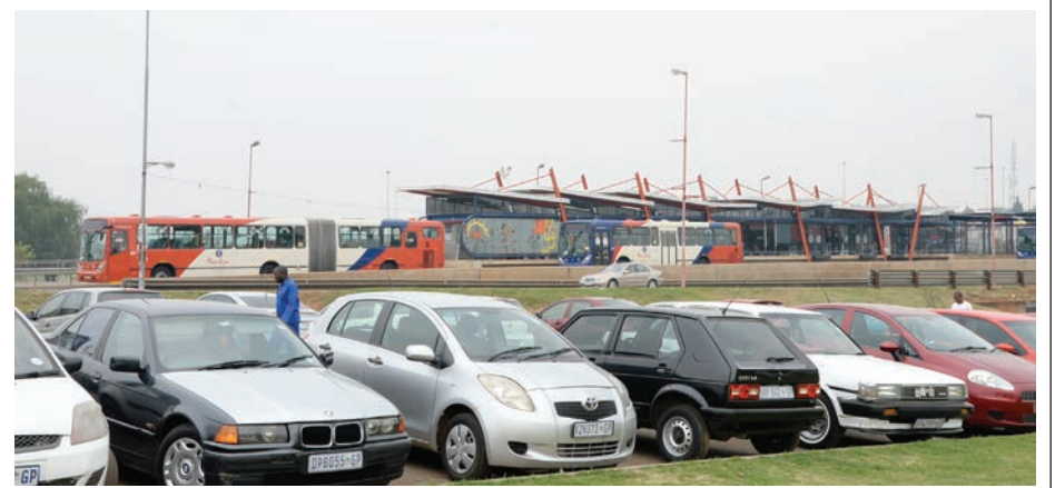
Vachayeri vo tala va paka swipandzamananga swa vona eswitichini swa ReaVaya kutani vakhandziya mabazi ku ya lomu va ya ku eJoni.