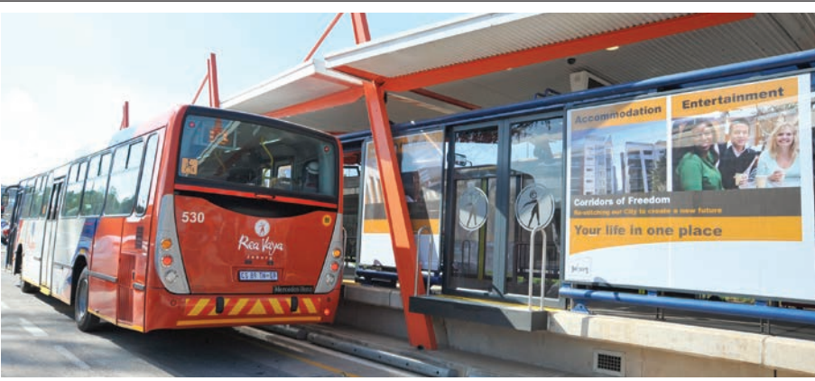
Idolobha laseGoli laba iDolobha lokuqala ukwethula uhlelo lwamabhasi olwaziwa ngokuthi yi-Bus Rapid Transit. Uhlelo lwe-ReaVaya selwenze ngcono indlela abantu abahamba ngayo.