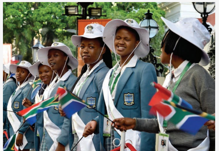
Abantu abasha baseNingizimu Afrika bakujabulelele ukuzwa lokho uMongameli Zuma abekuthulela izizwe.

Ukwakhiwa sekuqalile kumaPaki Ezolimo okungenani amahlanu, kumaPaki Ezolimo