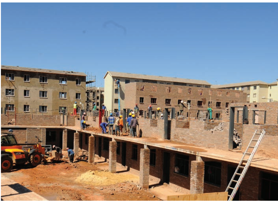
Kunemiklamo emikhulu yokwakhiwa kwezindlu okusakulunywa ngayo noma esisezigabeni zokuhlelelwa eGoli.

Goli liyaqhubeka nokuzihola phambili njengedolobha eliyindabulabuhlanga eNingizimu Afrika, njengoba libe nokuqagulwa kwezomnotho okuhle ekuqaleni konyaka wezi-2016. Nakuba zikhona izingqinamba zezomnotho, ukukhuphuka kwezilinganiso zenzalo kanye nokuguquguquka kwamandla emali ngesivini esiphezulu, iDolobha laseGoli liqenqeleza phambili ngokuba yisibonelo sozinziso kanye nokuphathwa kwezizimali ngokucophelela.