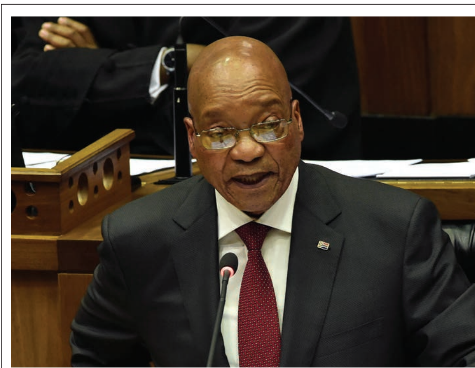
UMongameli uJacob Zuma usegugquzele abantu baseNingizimu Afrika ukuba basebenzisane ndawonye ukusiza leli lizwe ukuthi liqhubekela phambili.