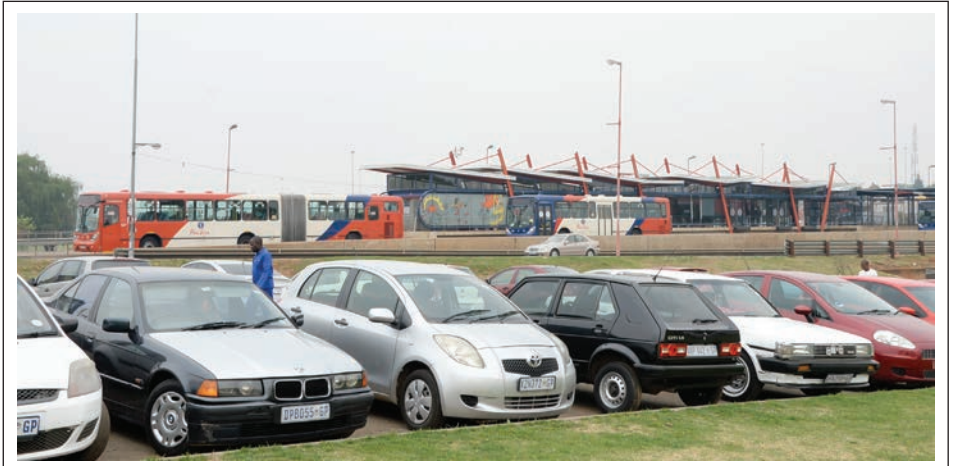
Abantu abaningi abasebenzisa izimoto ezincane manje sebepaka izimoto zabo eziteshini ze-ReaVaya bese begibela emabhasini ukuze bahambe idolobha laseGoli lonkana.

Nemingcele Yenkululeko. Imingcele Yenkululeko yizintuthuko eziqondene nezinto zokuthutha ezizokwenza idolobha laseGoli lenze kangcono ngokudlulele kunoklanywa kwemingcele yedolobha kwesikhathi sobandlululo ngokusondeza izikole, izinsizakalo, amathuba emisebenzi