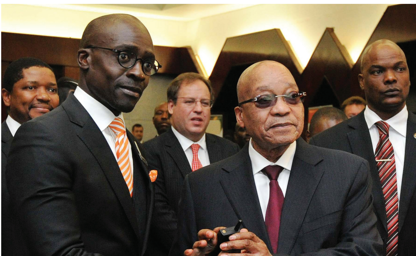
Mengameli Jacob Zuma kanye neNduna yeLitiko Letasekhaya Malusi Gigaba ngesikhatsi kwetfulwa i-e-HomeAffairs.