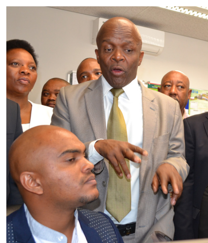
USodolophu wase-Ekurhuleni uMondli Gungubele ngethuba etyelele kwiklinikhi iVilla Liza esanda kwakhiwa eBoksburg.

USodolophu uGungubele ukwakhankaye nokubaluleka kokuqinisekiswa ukuba abahlali banezindlu ezisemgangathweni.