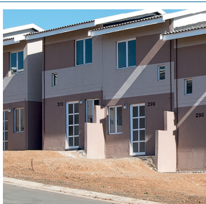
INKqubo yeziNdlu yase-Cornubia ibonelela abantu baKwaZulu-Natal ngezindlu ezifuneka kakhulu.

Esi sixeko sibekele bucala isixa esizibhiliyoni eziyi-3.4 zeerandi amaphulo okwakhiwa kwezindlu ukuqinisekisa ukuba abahlali baso banikwa izindlu eziphucukileyo nezinesidima. "Ukunikezelwa kwezindlu, iinkonzo ezisisiseko nezentlalo kuhambisana ngqo nokwakhiwa kweendawo zokuhlalisa abantu ezizinzileyo nezinato konke," utshilo.