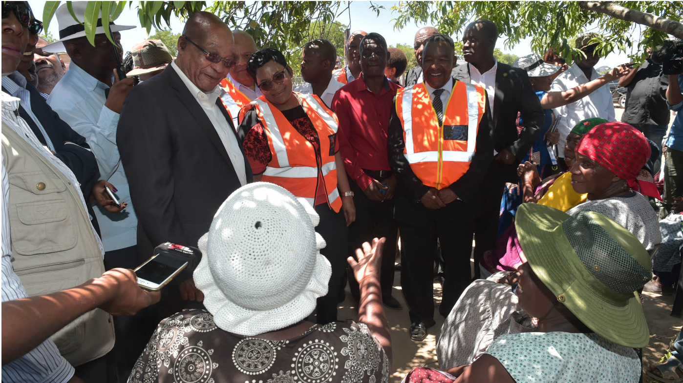
Government has come up with creative ways to improve and ensure that there is constant communication with its citizens.