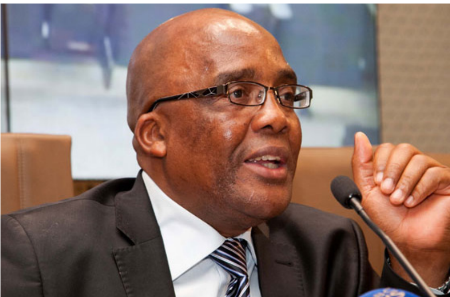
UMphathiswa wezeMpilo uGq Aaron Motsoaledi ubhengeze iinkqubo zikarhulumente zokulwa noGawulayo (i-AIDS) kunye neNtsholongwane yakhe (i-HIV).