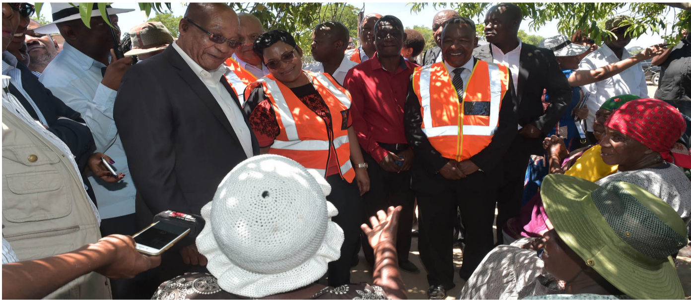
Government has come up with creative ways to improve and ensure that there is constant communication with its citizens