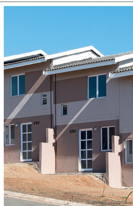
Umklamo weTindlu iCornubia unika takhamuti taKwaZulu-Natal tindlu letidzingeke kakhulu.