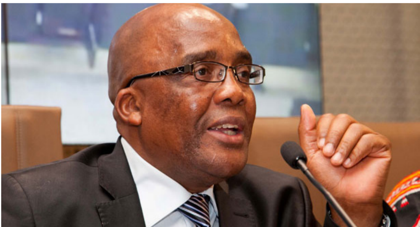
Indvuna yeTempilo Dkt. Motsoaledi umemetele lisu lahumende lekulwa neSandvulelangculazi kanye nengculazi.