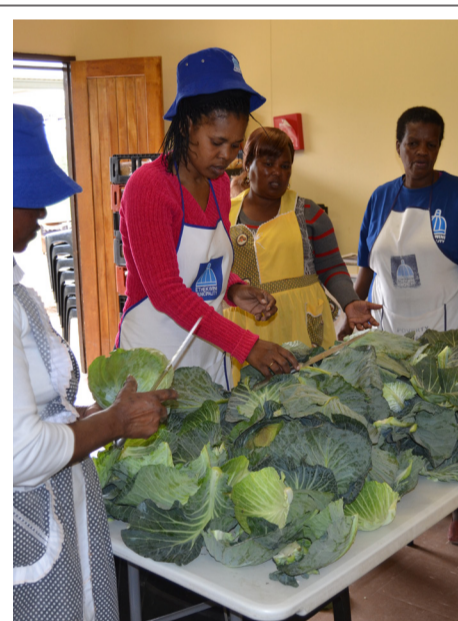
Emakhulukhulu ebantfu ayazuzo ngalelisobho lasekhishini laMasipala waseThekwini.

"Kunika bantfu tindlu, tinsita letisisekelo kanye netenhlo kuhambisana nekudala kuhlaliswa kwebantfu lokusimeme," kwasho yena.