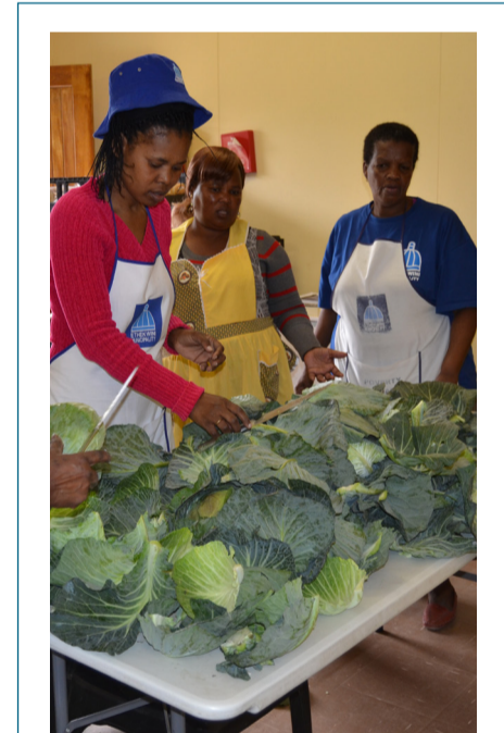
Mađana a vhatu vha khou vhuvelwa u bva kha vhurangeli ha khishi ya swobo ha Masipala wa eThekwini.

“Ñqisedzo ya dzinŋu, tshumelo ya ndeme na ya matshilano i tshimbilelana na na zwa u bveledza vhudzulo ha vhatu ha tshoŋhe,” vho ralo.