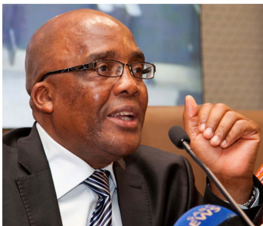
Minisiḁa wa Mutakalo Dokotela Vho Aaron Motsoaledi vho qivhadza pulane dza muvhuso dza u lwa na HIV na AIDS.

Fulu li ḁo sedzesa kha maimo maḁanu a ndeme: