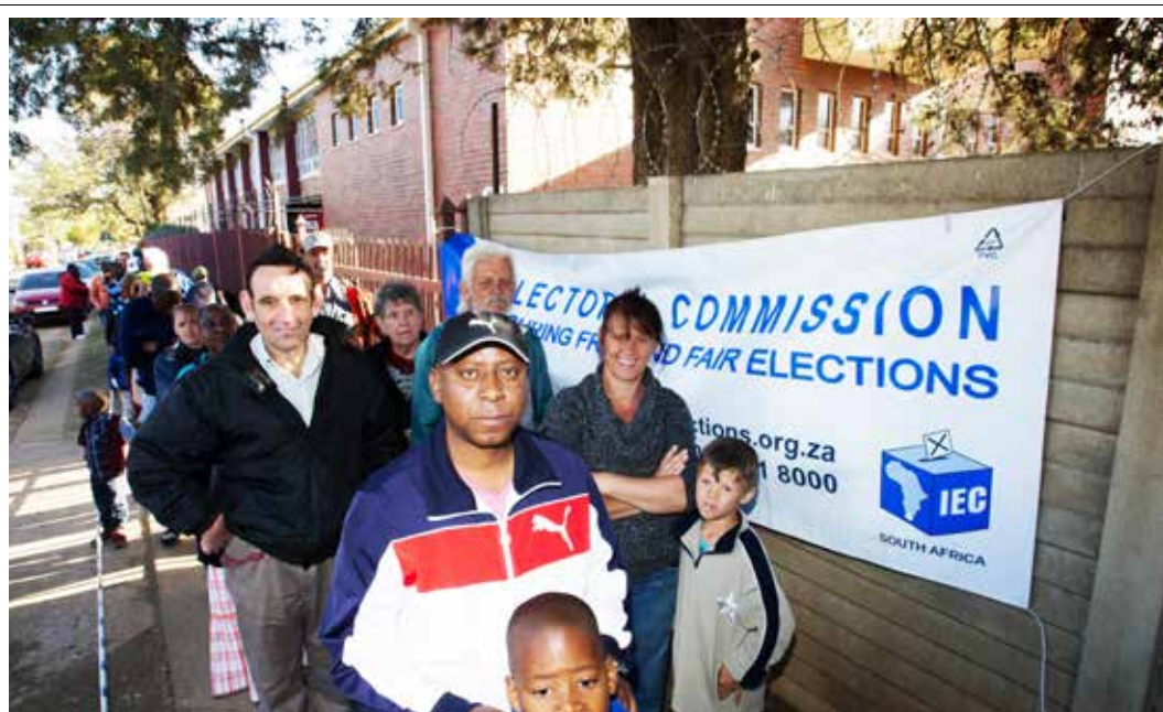
South Africans came out in numbers to cast their votes in the 2016 Local Government elections.