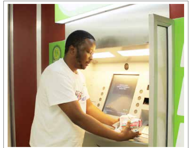
Lekala la Kabo ya Dihlare le tla fa balwetši phihlelelo go tlhokomelo ya maphelo ya maemo a godimo.

Ge a bolela ka Khonferentsheng ya AIDS ya Bo-